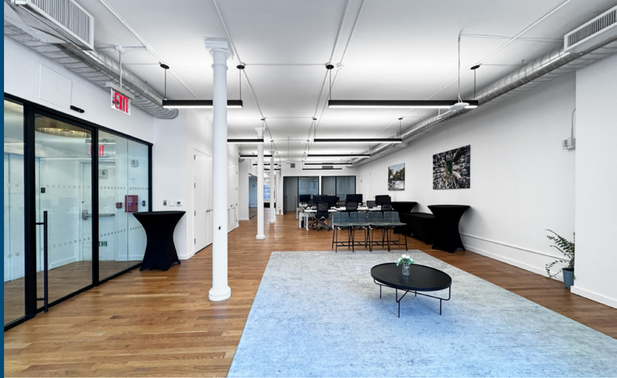
Furniture shown for layout concept only