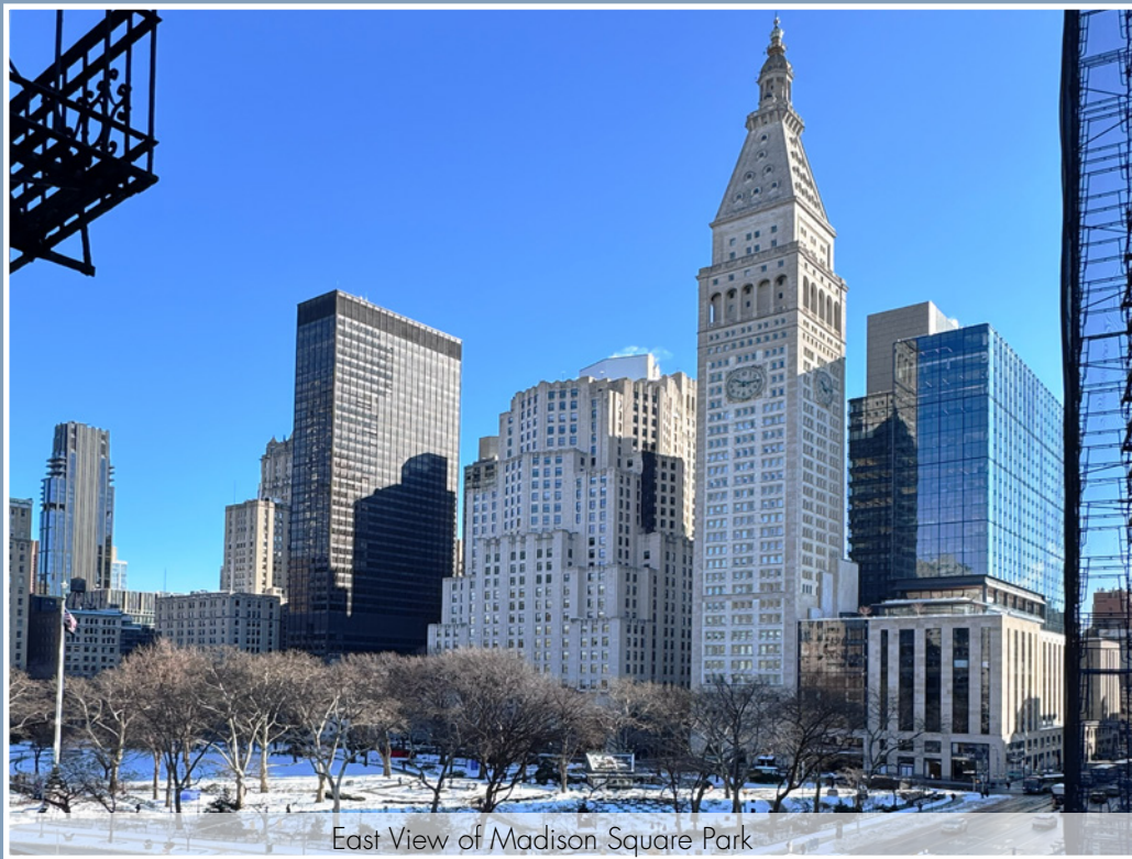
East View of Madison Square Park