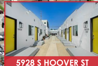
5928 S HOOVER ST