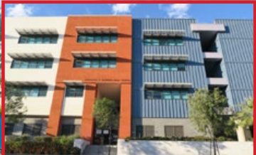
AUGUSTUS HAWKINS HIGH SCHOOL