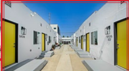
5928 S HOOVER ST