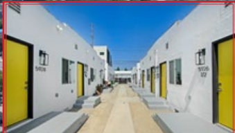
5928 S HOOVER ST