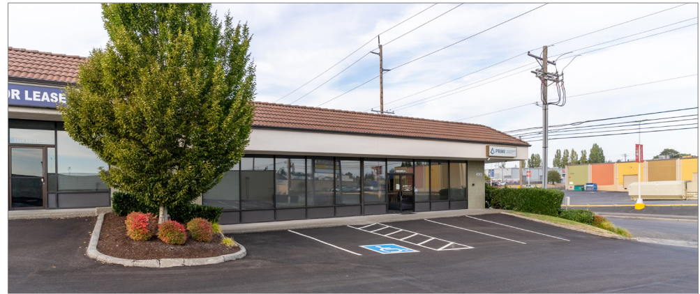
Building A (3630)