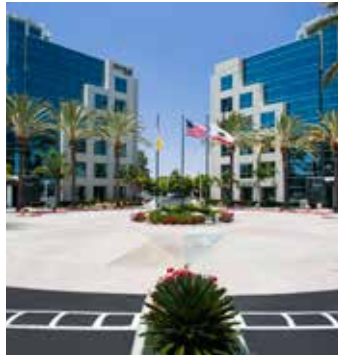
Seaview CC, San Diego CA