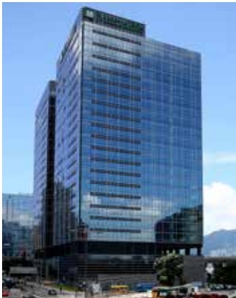
One Bay East, Hong Kong