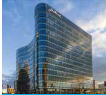
601 Congress St., Boston MA