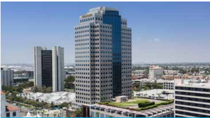
Exterior of Landmark Square