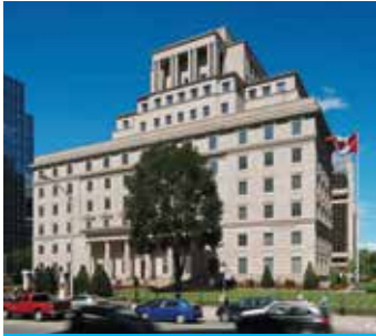
200 Bloor St. E., Toronto ON