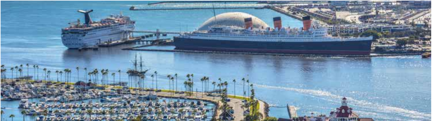
View from Landmark Square