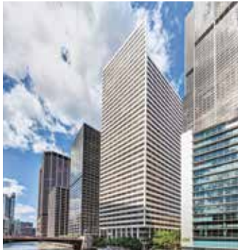
200 S Wacker Dr., Chicago IL