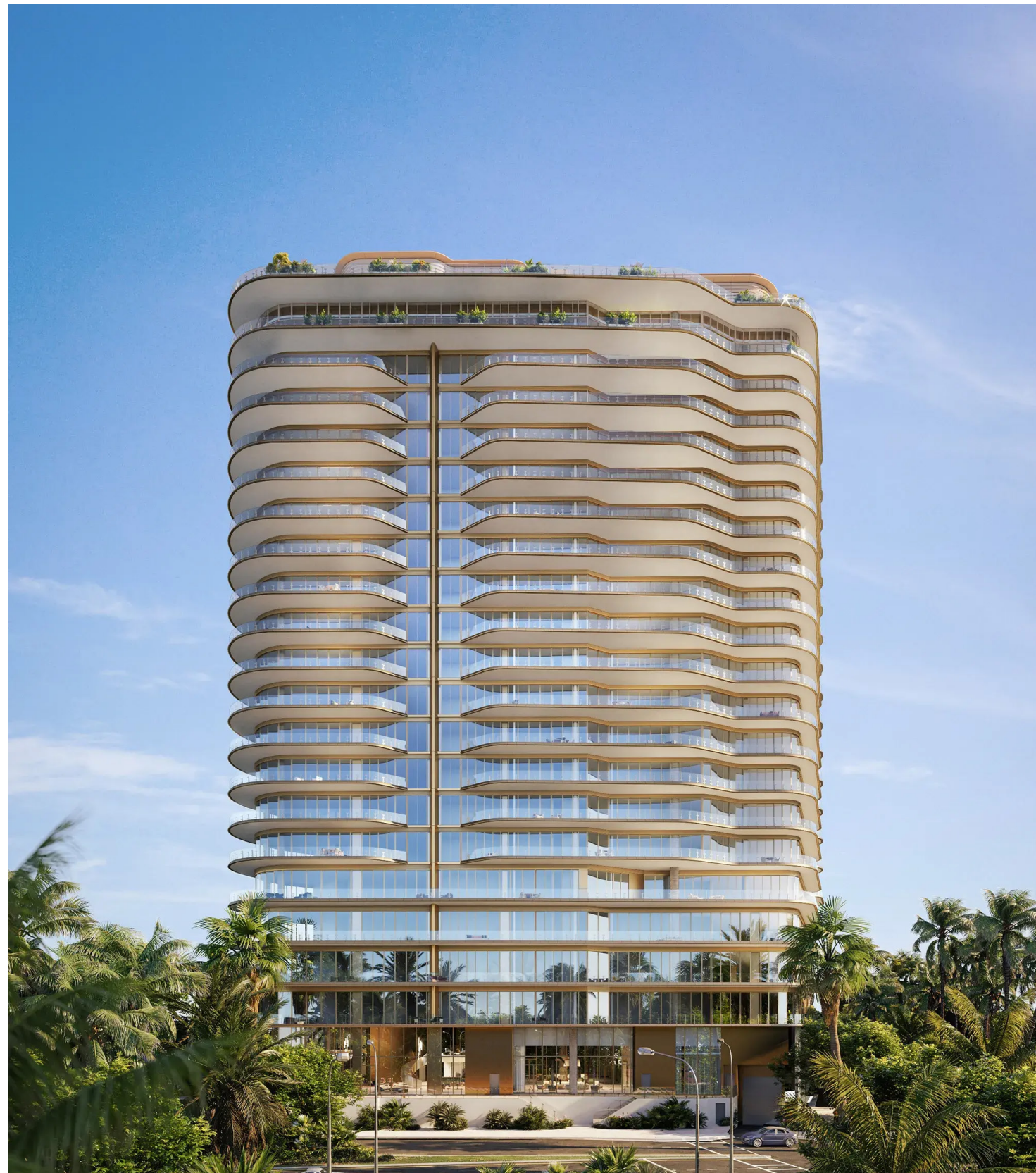
Four Seasons Private Residences | Coconut Grove