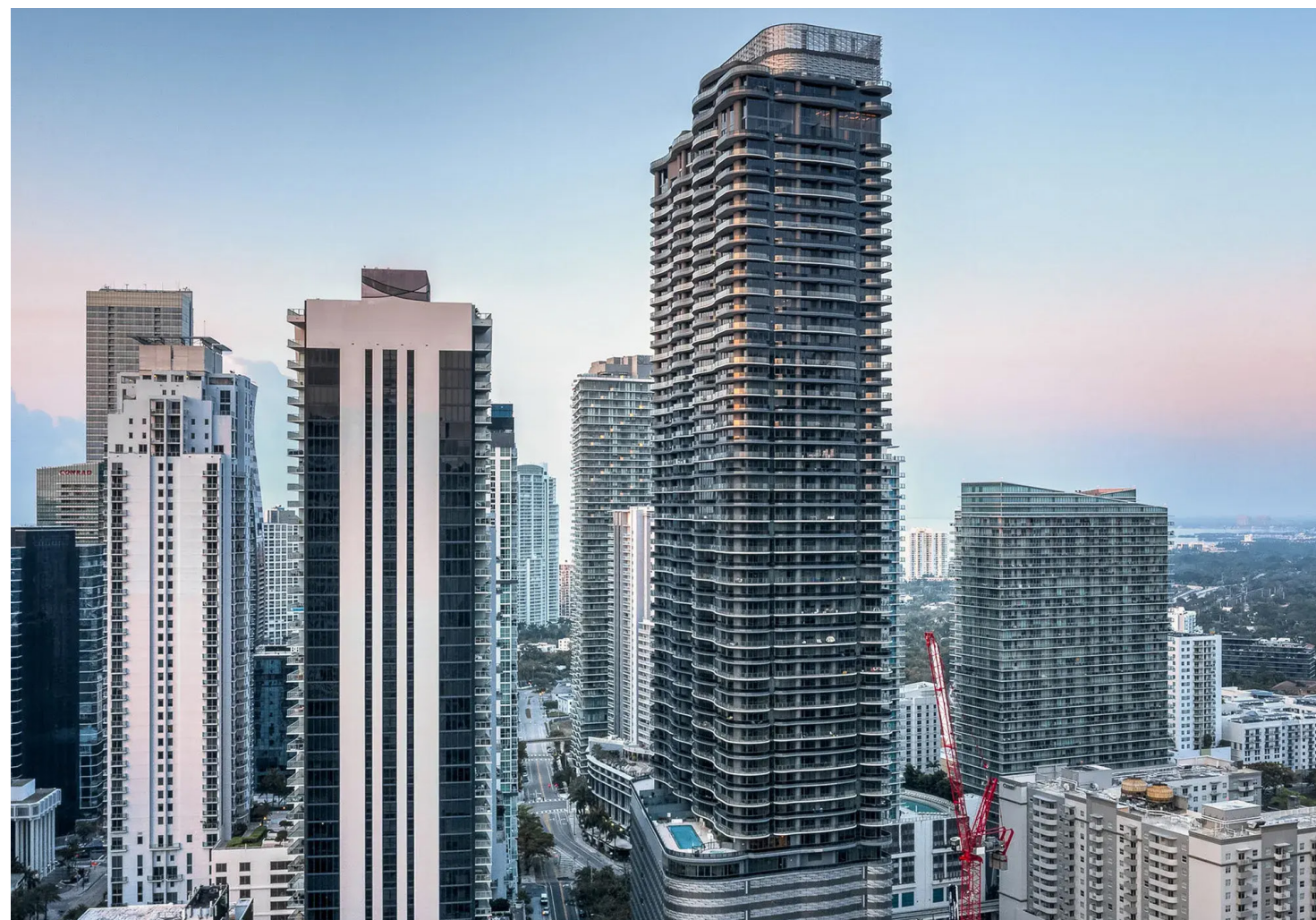
Brickell Flatiron | Brickell