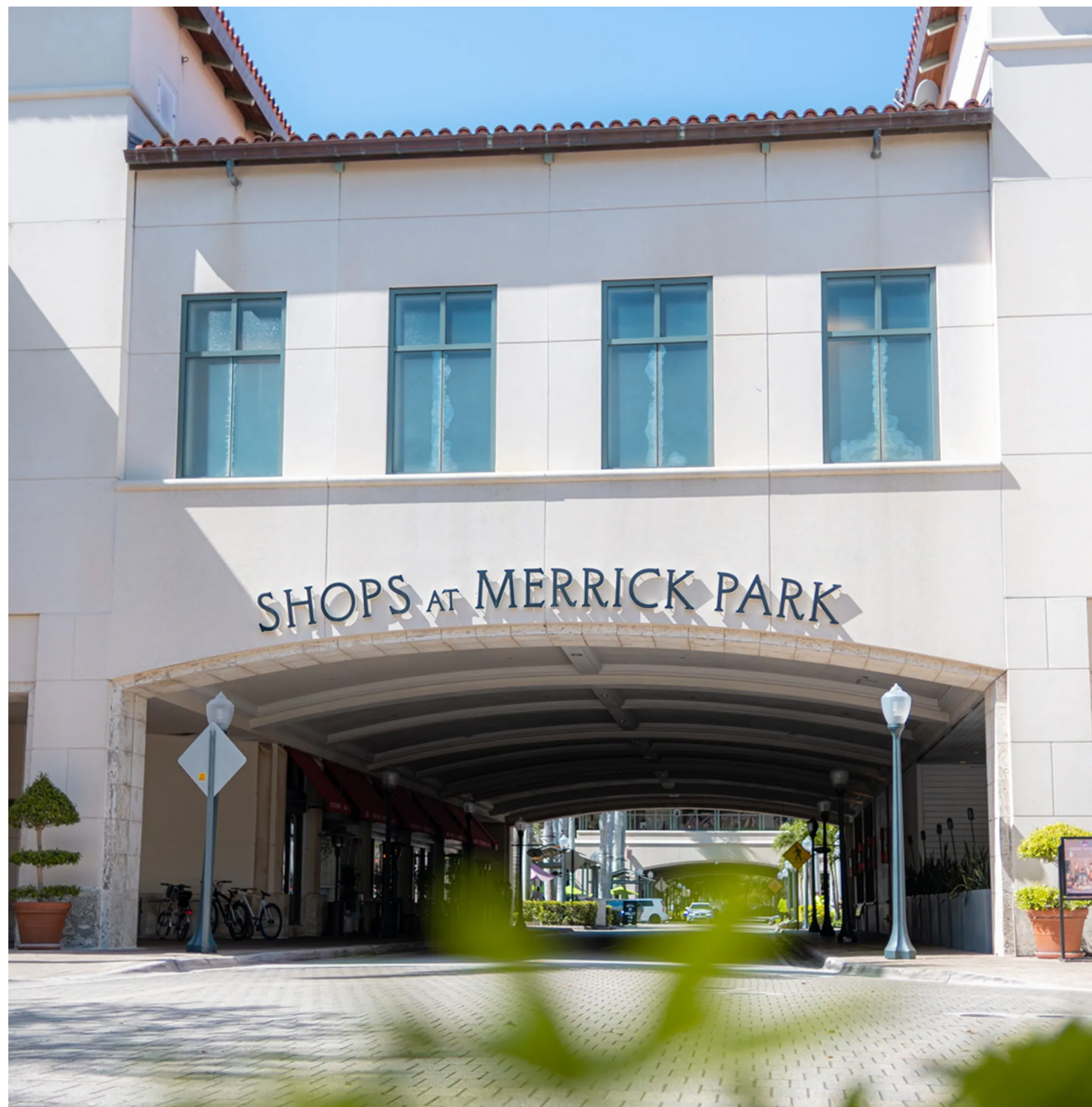
A refined destination offering an inviting mix of upscale boutiques and exceptional dining