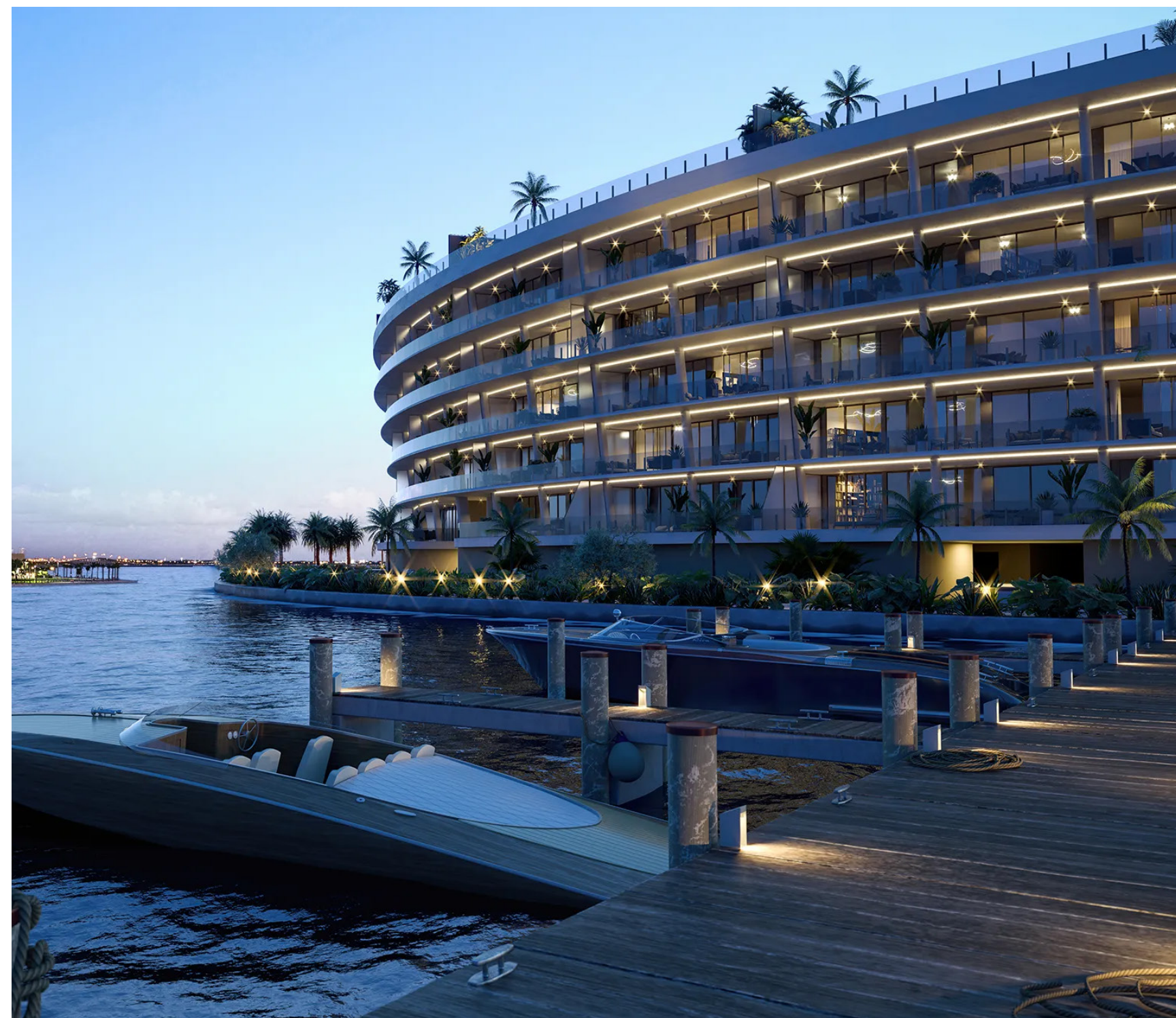
Vita at Grove Isle | Coconut Grove