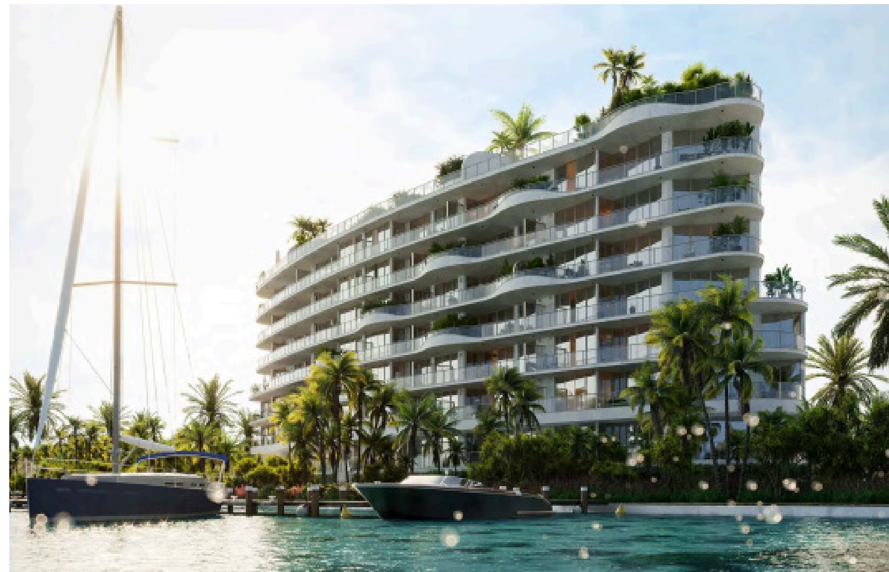
Onda Residences | Bay Harbor