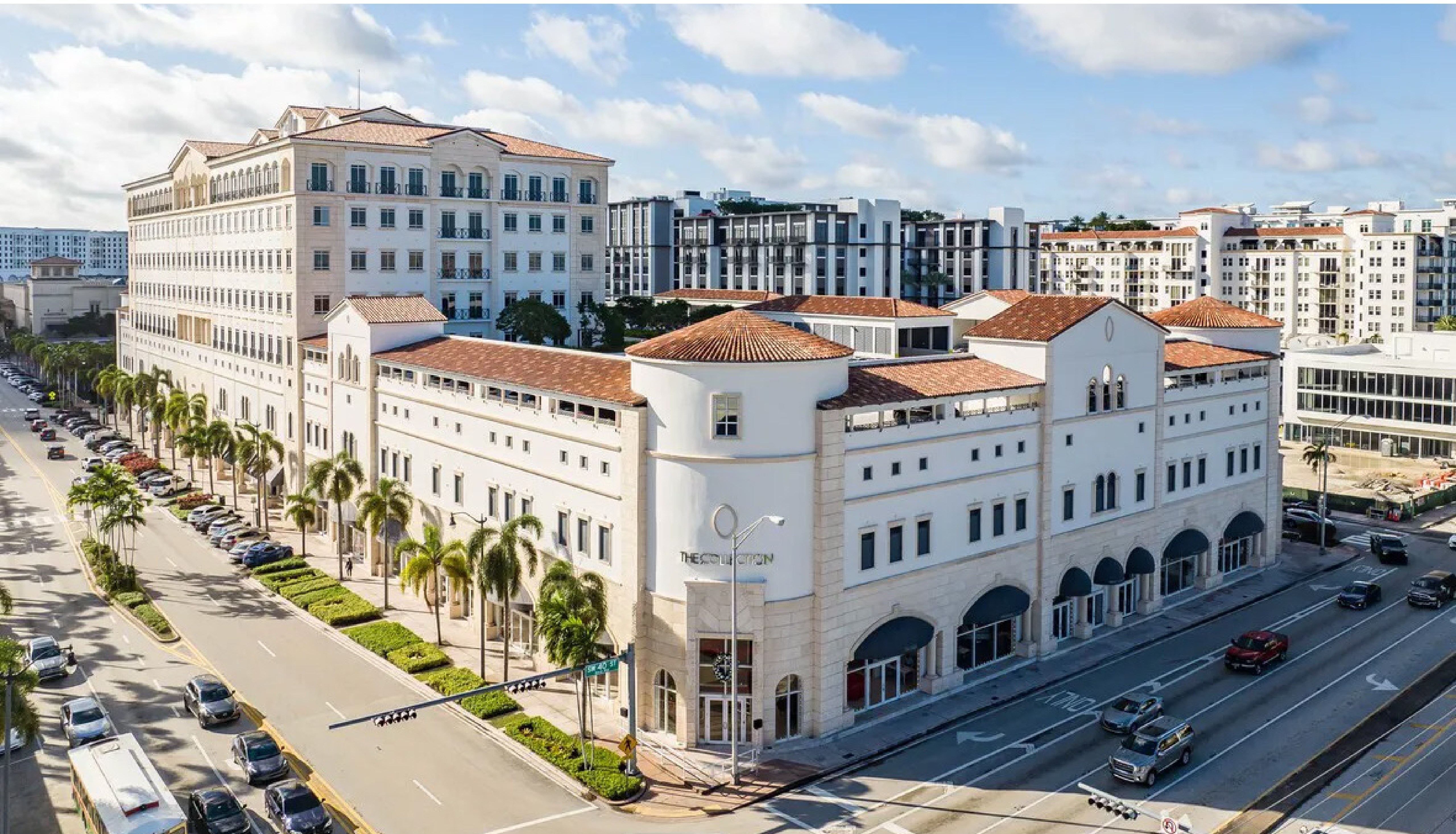
A nine-story Class A mixed-use property featuring premium office and retail space