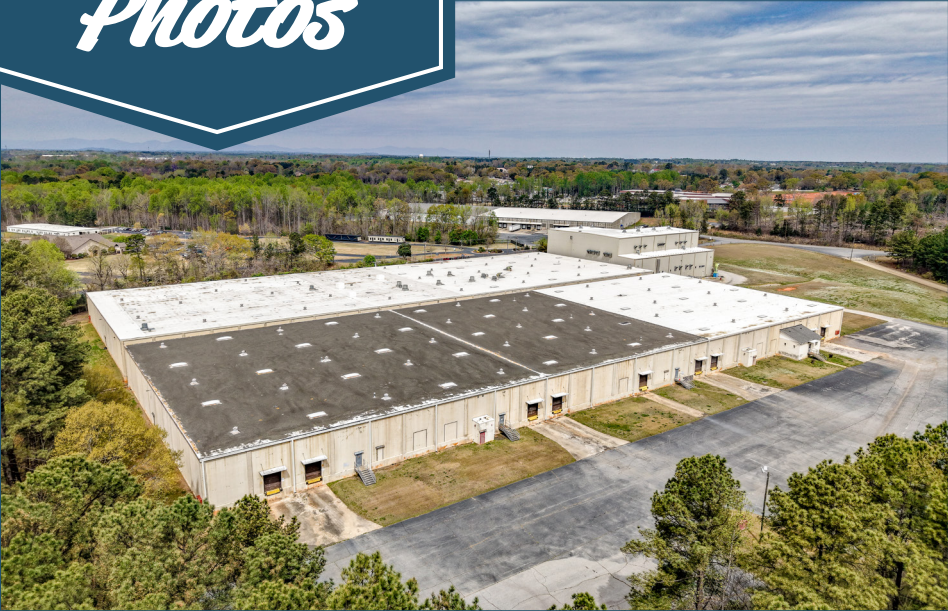
Warehouse Exterior and Aerial Photos