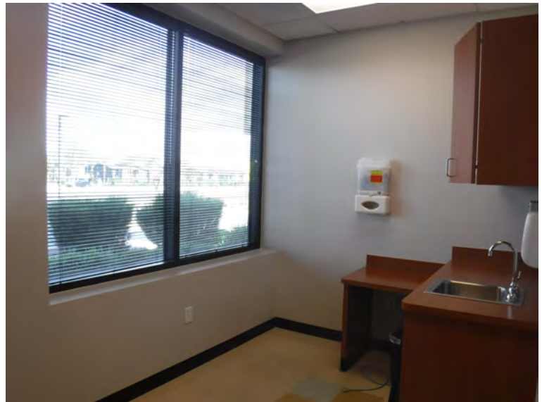
One of Three Exam Rooms

3175 St. Rose Pkwy, Suite 120A • Henderson, NV 89052