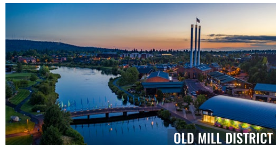
OLD MILL DISTRICT

Redmond Municipal Airport (RDM) offers daily non-stop flights to Burbank, Denver, Las Vegas, Los Angeles, Palm Springs, Phoenix, Portland, Salt Lake City, San Diego, San Francisco, Santa Rosa, and Seattle. These destinations are served by airlines including Alaska Airlines, American Airlines, Avelo Airlines, Delta Air Lines, and United Airlines. The airport is undergoing a $170 million expansion to double its terminal size, adding a new concourse with seven jet bridges by 2027.