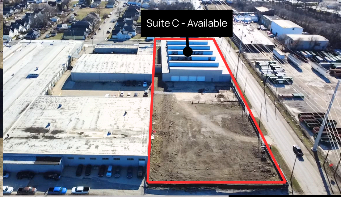
Suite C - Available