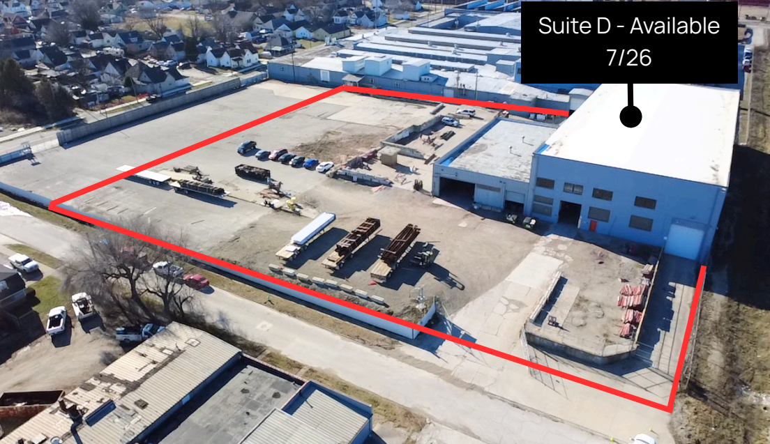
Suite D - Available 7/26