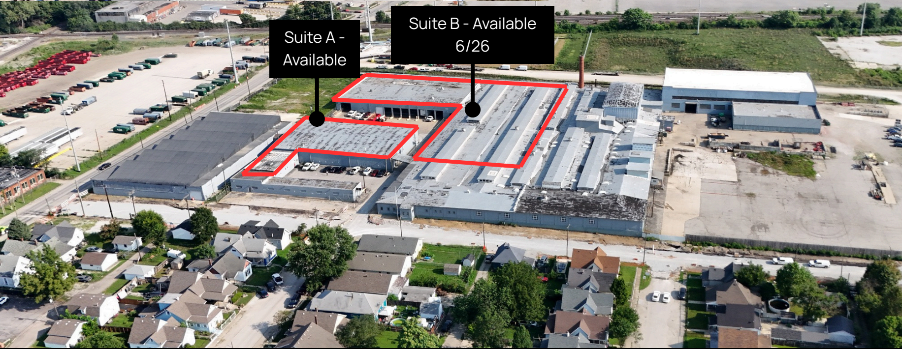
Suite A - Available