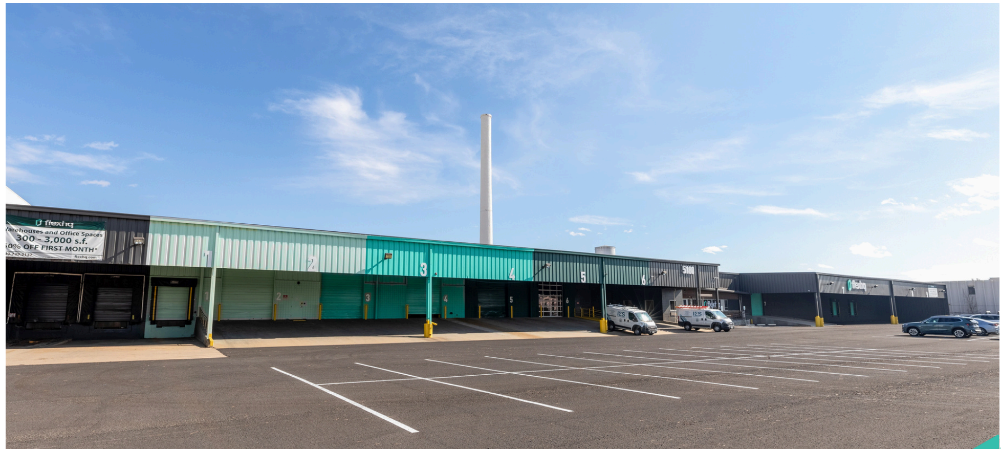
9 LOADING DOCKS, TRUCK-HEIGHT + RAMP LOADING & ONSITE PARKING