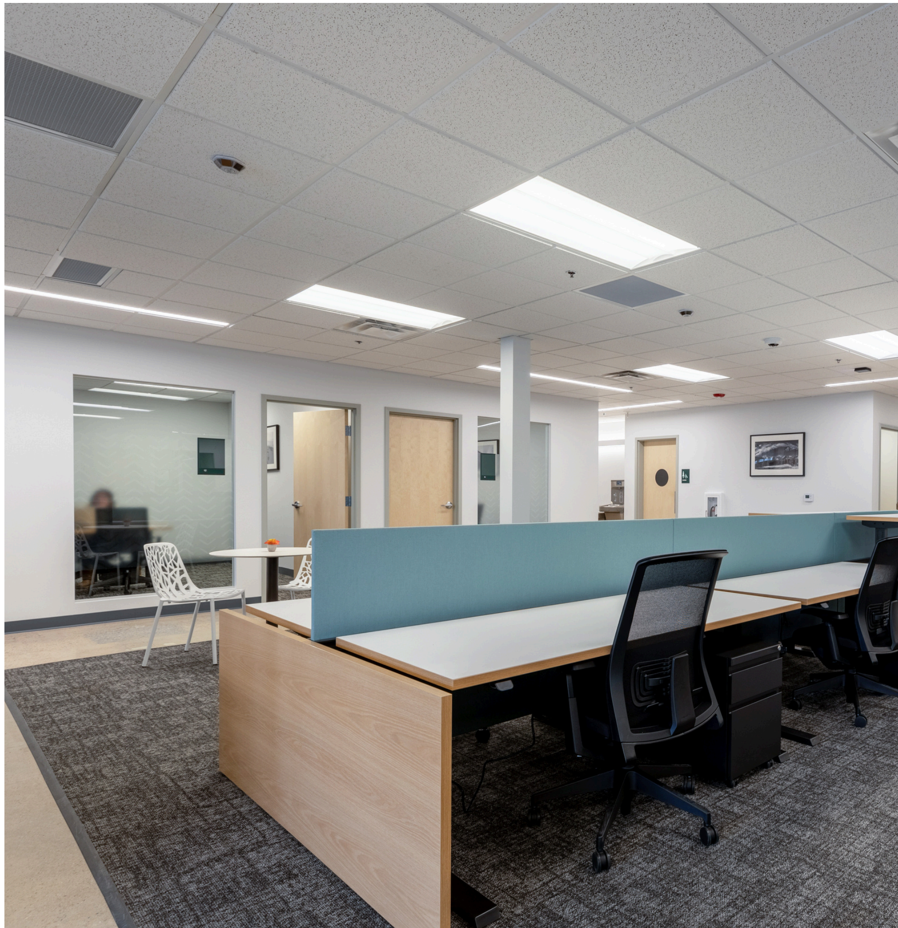
OFFICES & COWORKING SPACES