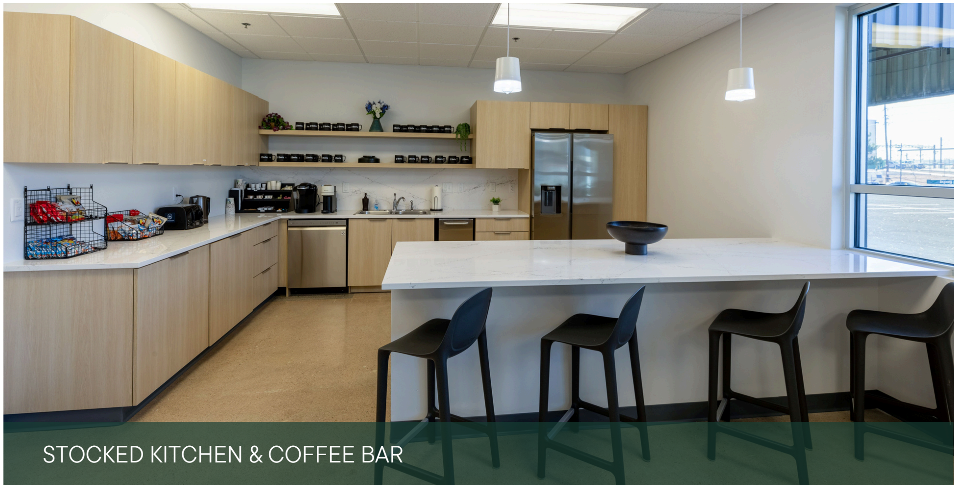
STOCKED KITCHEN & COFFEE BAR