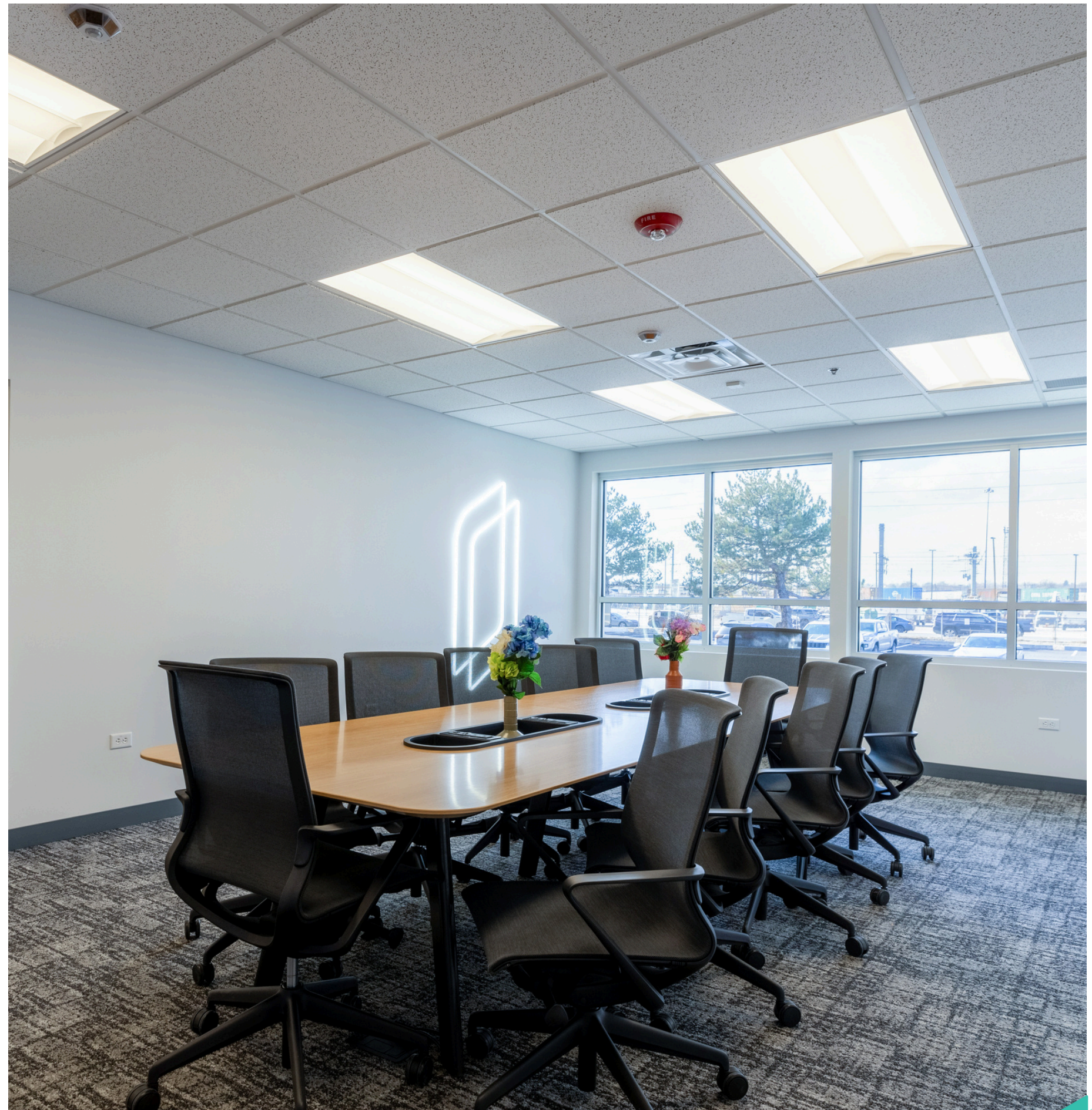
CONFERENCE & MEETING ROOMS