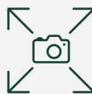
Photo & Podcast Studio