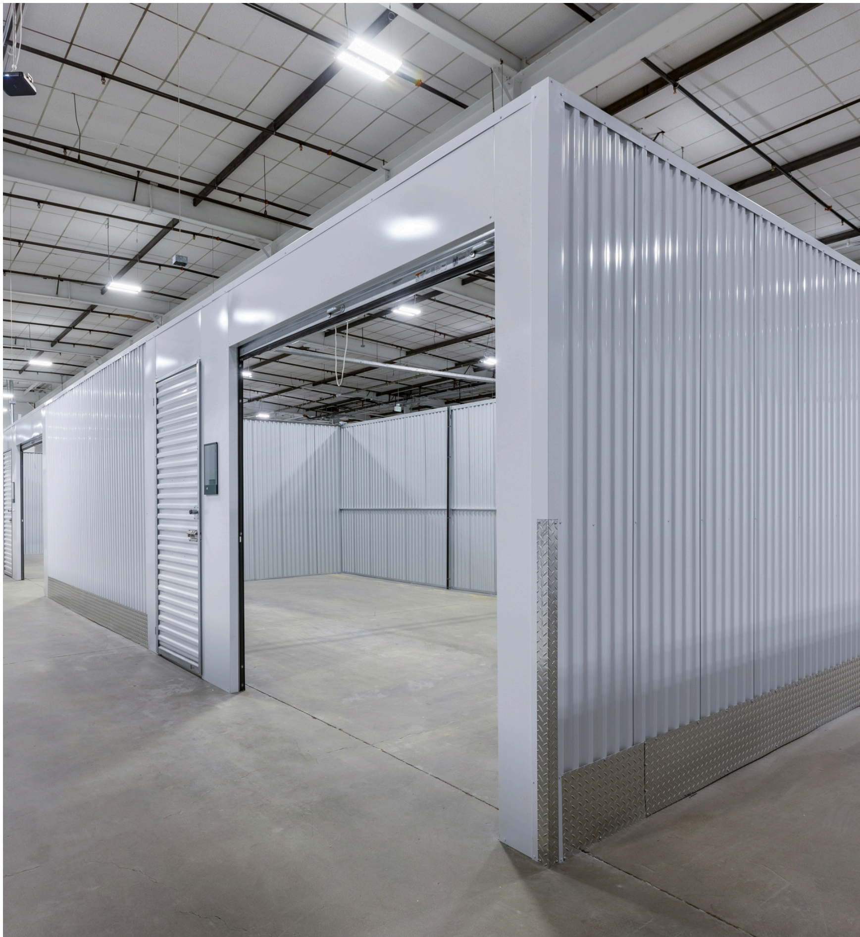
WAREHOUSE SPACES FROM 400-3,500+ SF