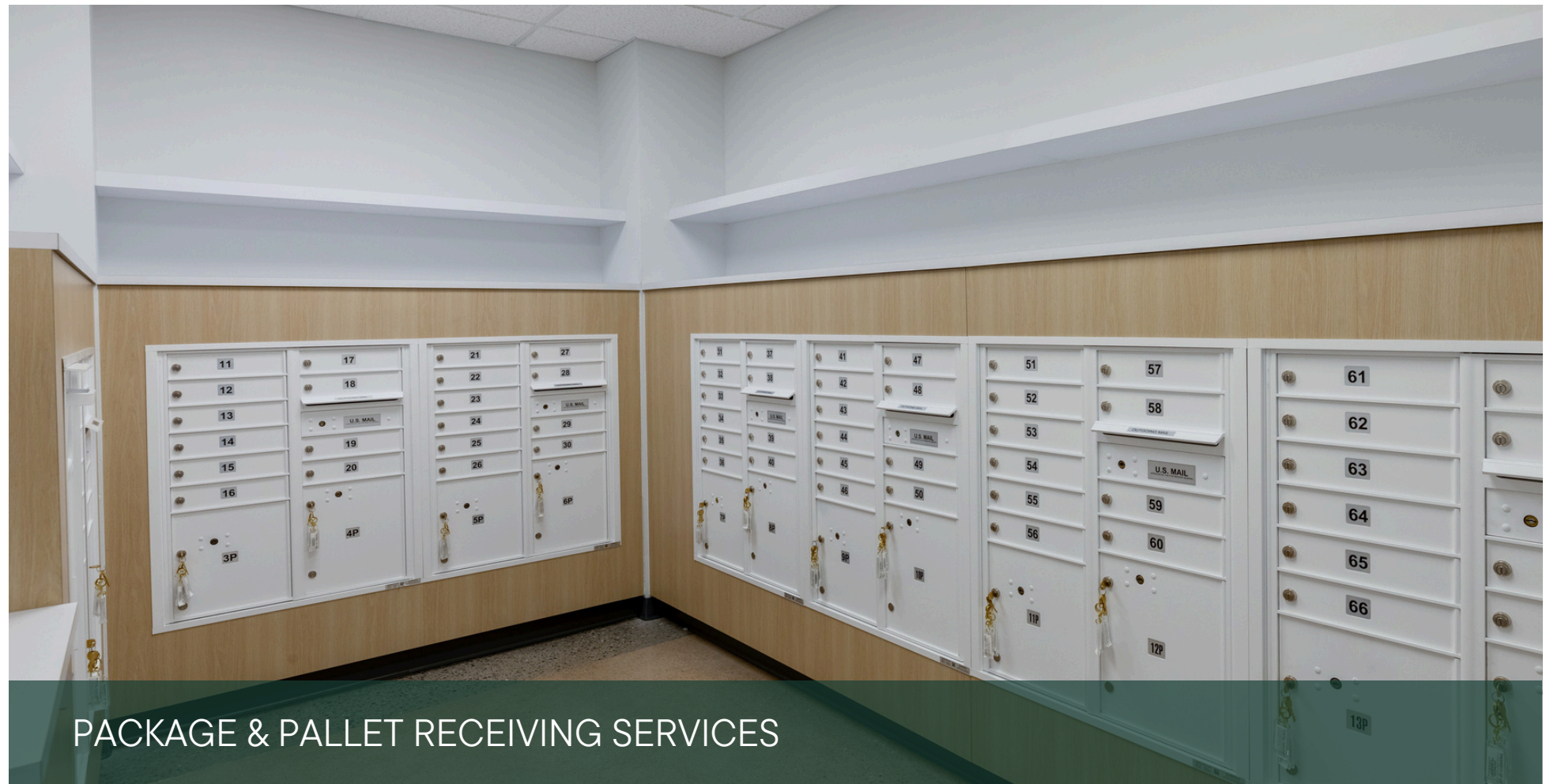
PACKAGE & PALLET RECEIVING SERVICES