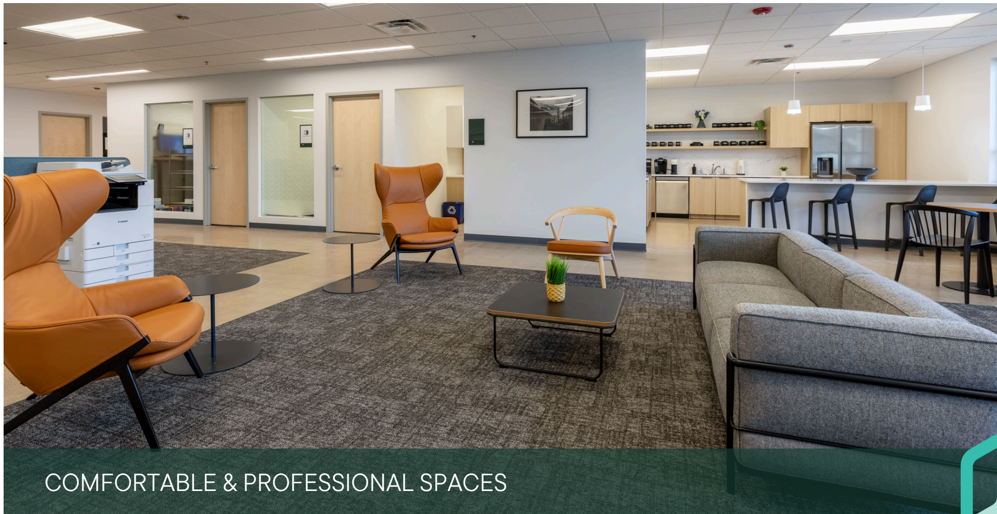
COMFORTABLE & PROFESSIONAL SPACES