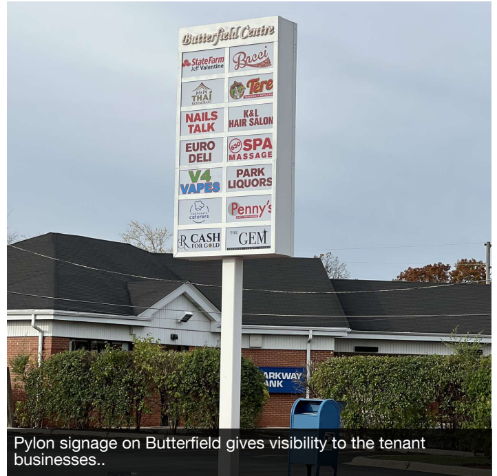
Pylon signage on Butterfield gives visibility to the tenant businesses..