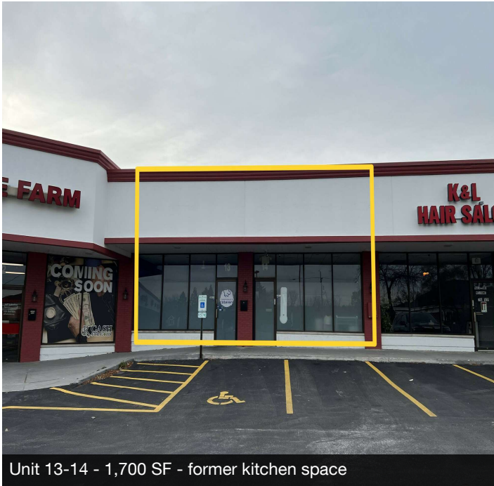
Unit 13-14 - 1,700 SF - former kitchen space

22w535 Butterfield Road Glen Ellyn, IL 60137