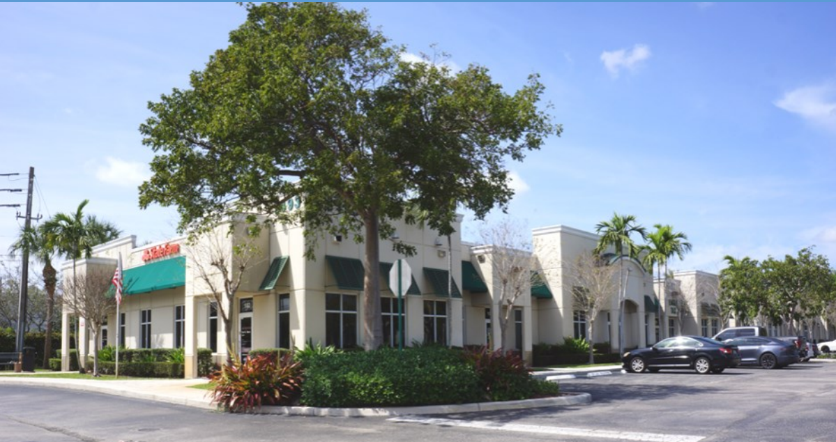
Beautiful Finishes, Hurricane Doors and Windows