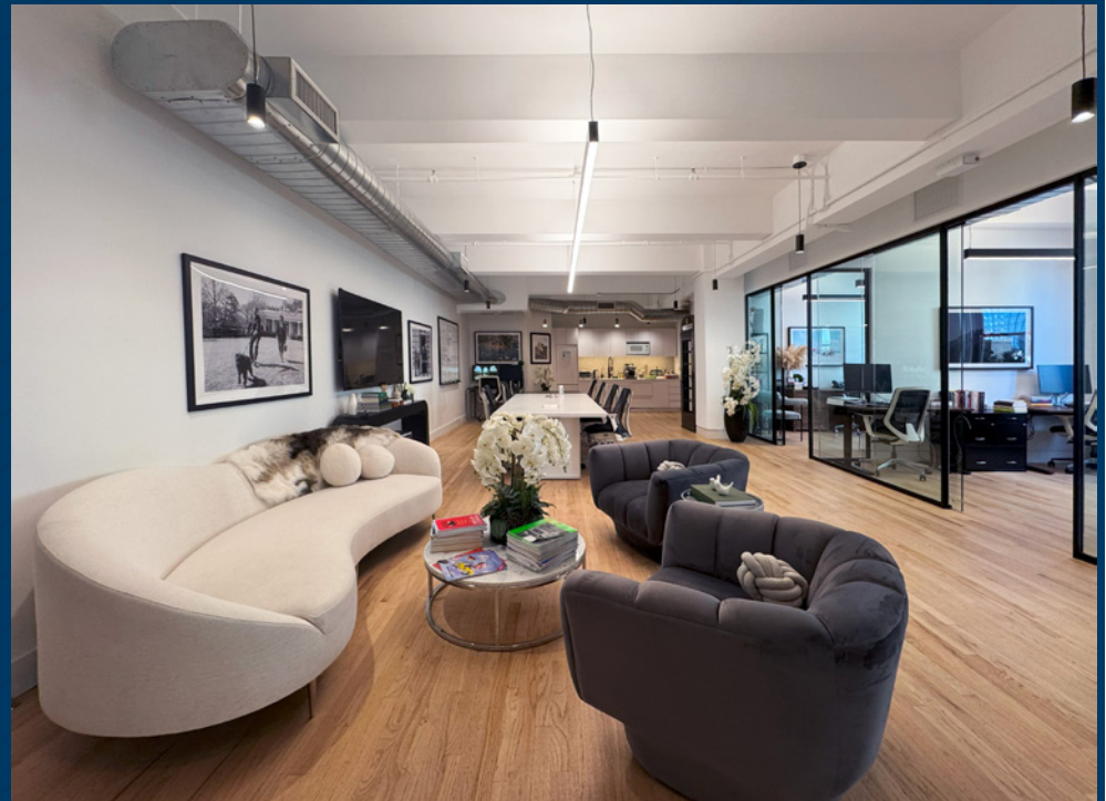
Furniture shown for layout concept only

ABS Partners Real Estate, as the exclusive agent is pleased to offer the following opportunity for lease: