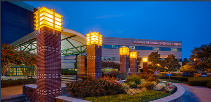
Conroe Regional Medical Center is 6 miles east of the Property