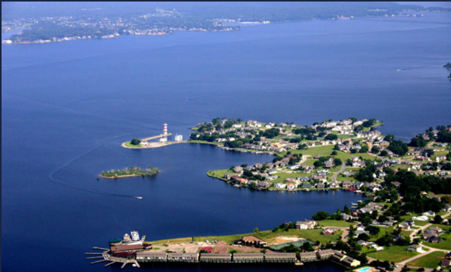
Lake Conroe is 22,000 acres with over 150 miles of shoreline.