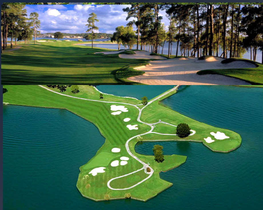
There are several public & private golf courses around the lake