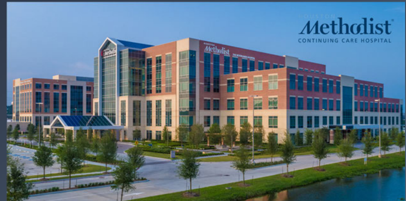
Houston Methodist Hospital, located 20 minutes from the property.