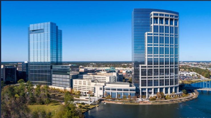
Multiple office complexes are 20 minutes from the property.