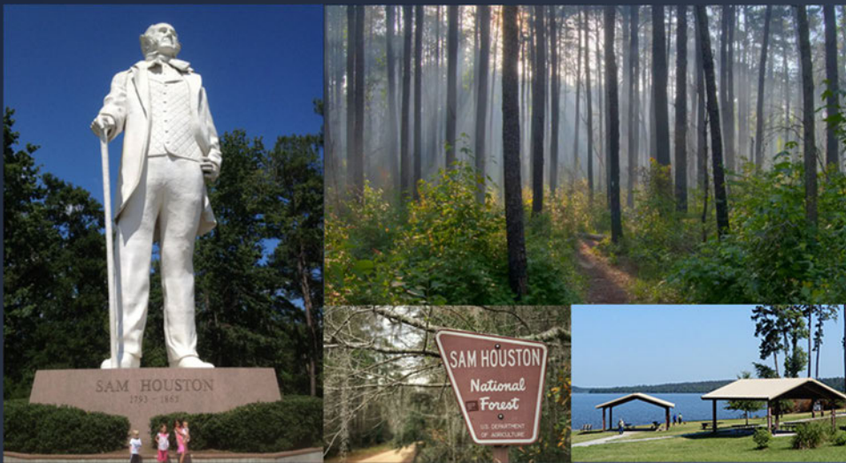
Sam Houston National Forest is located on the north side of Lake Conroe and contains 163,000 acres with camp sites and hiking trails.