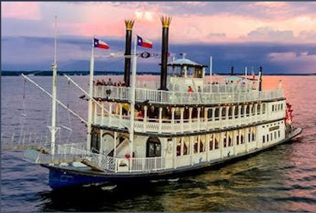
The Southern Empress, a 130-foot paddle-wheeler, offers dinner cruises.