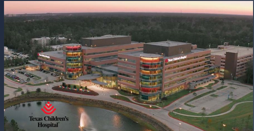
Texas Children's Hospital, located 20 minutes from property