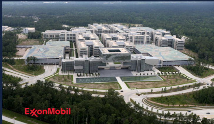
8 million SF campus, located 25 minutes to property.