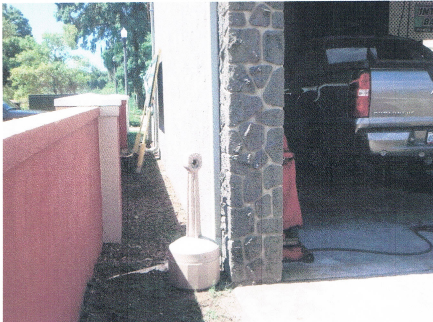
Rear View – Taken 6-16-15