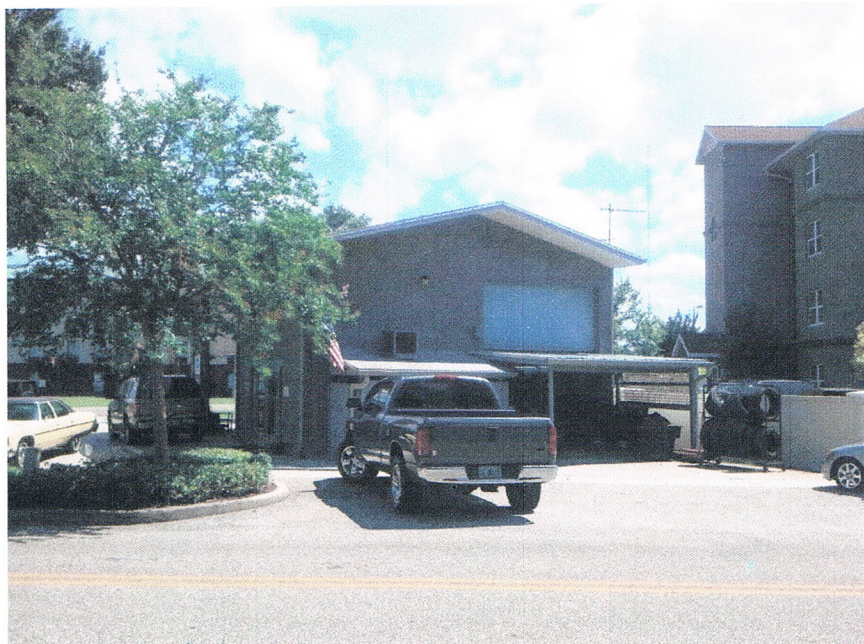
Right Side View – Taken 6-16-15