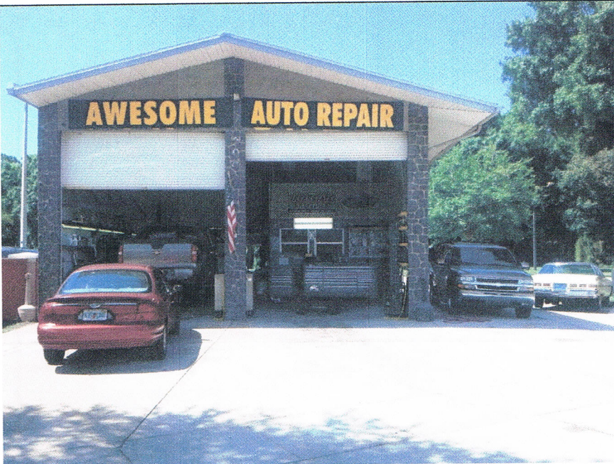
Left Side View – Taken 6-16-15

If using the Elevation Certificate to obtain NFIP flood insurance, affix at least 2 building photographs below according to the instructions for Item A6. Identify all photographs with date taken; "Front View" and "Rear View"; and, if required, "Right Side View" and "Left Side View." When applicable, photographs must show the foundation with representative examples of the flood openings or vents, as indicated in Section A8. If submitting more photographs than will fit on this page, use the Continuation Page.