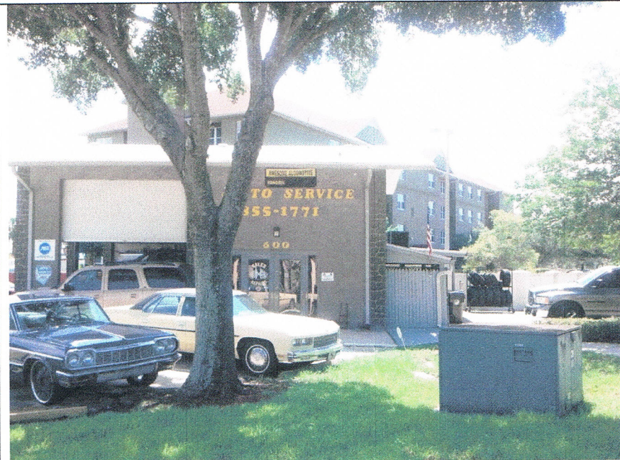
Front view – Taken 6-16-15

If submitting more photographs than will fit on the preceding page, affix the additional photographs below. Identify all photographs with: date taken; "Front View" and "Rear View"; and, if required, "Right Side View" and "Left Side View." When applicable, photographs must show the foundation with representative examples of the flood openings or vents, as indicated in Section A8.