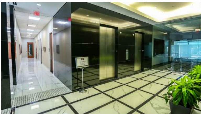
NEWLY RENOVATED COMMON AREAS