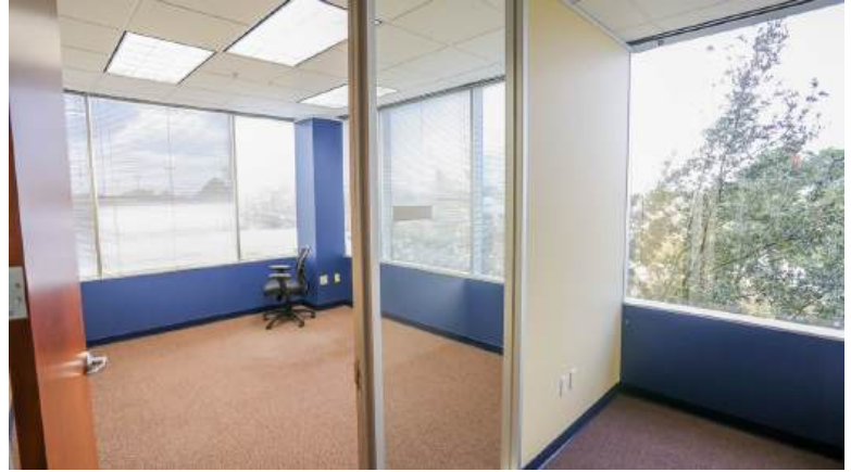
FINISHED OFFICE 3RD FLOOR