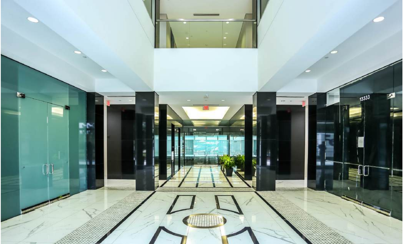
NEWLY RENOVATED LOBBY