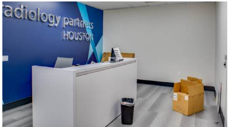
5TH FLOOR RECEPTION