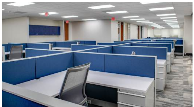
5TH FLOOR CUBE AREA