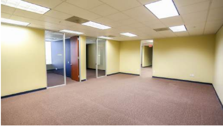
OPEN BULLPEN 3RD FLOOR