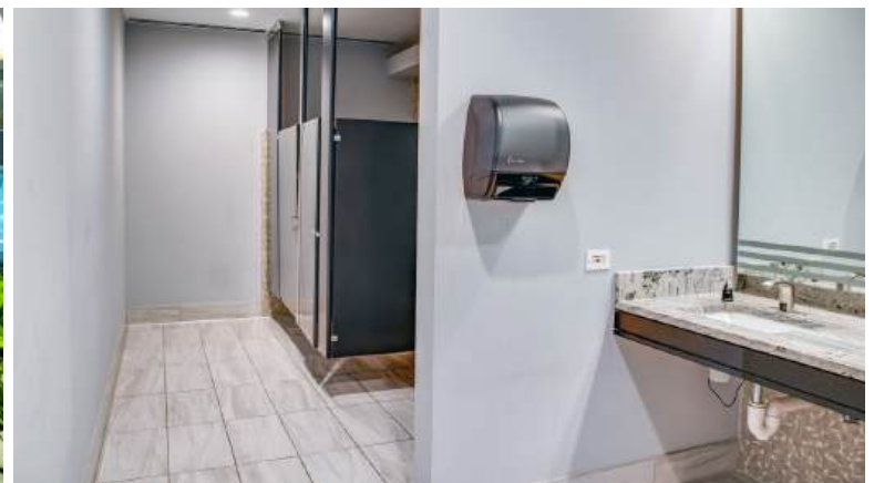
NEWLY RENOVATED RESTROOMS