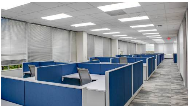
5TH FLOOR CUBE AREA