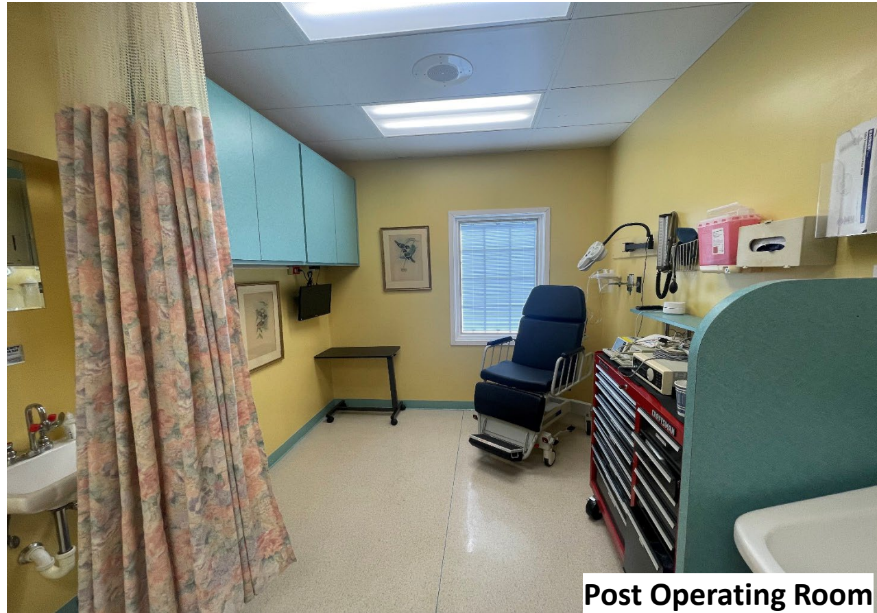
Post Operating Room