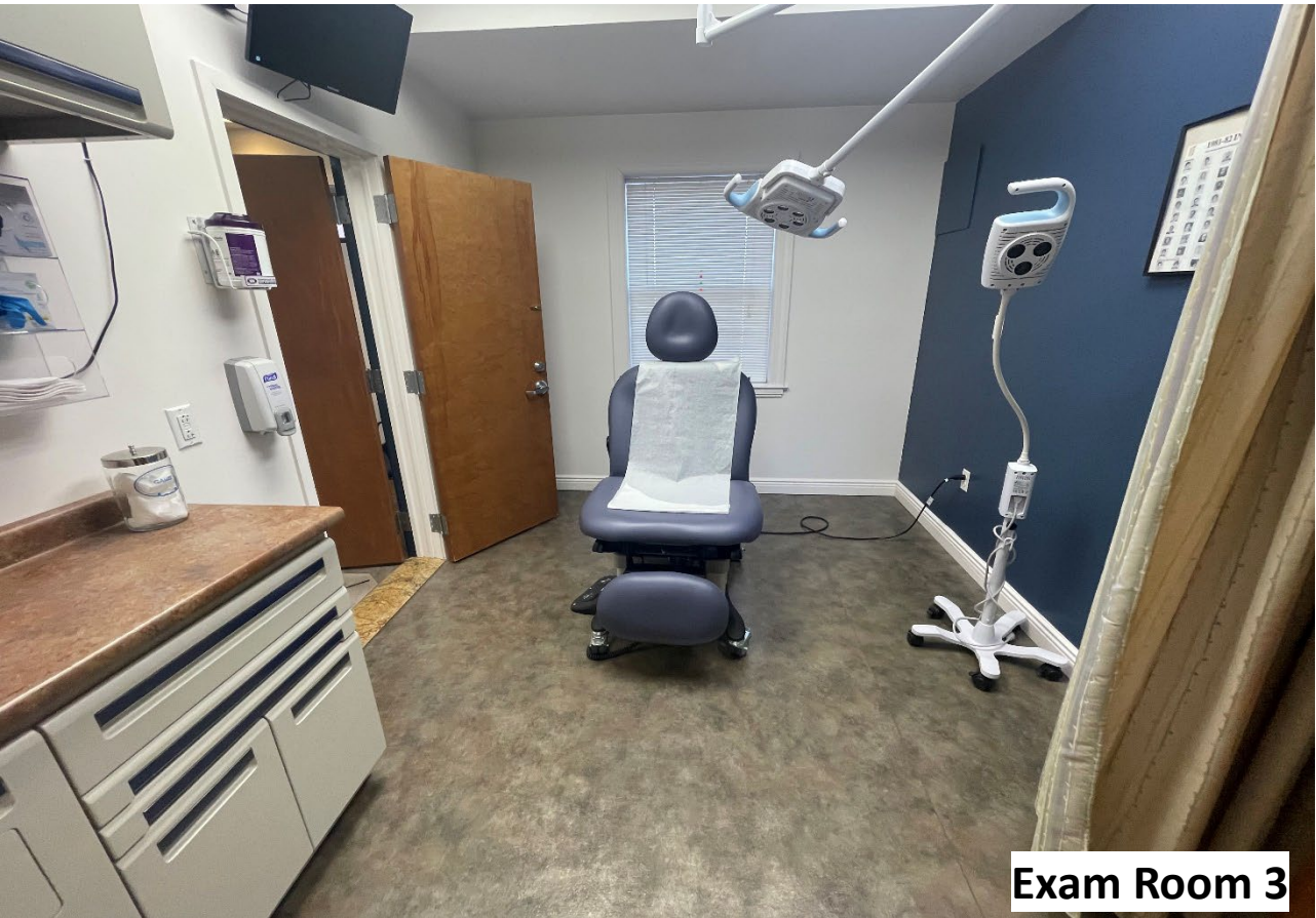
Exam Room 3