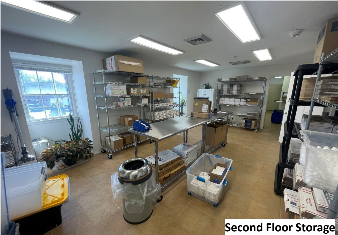
Second Floor Storage