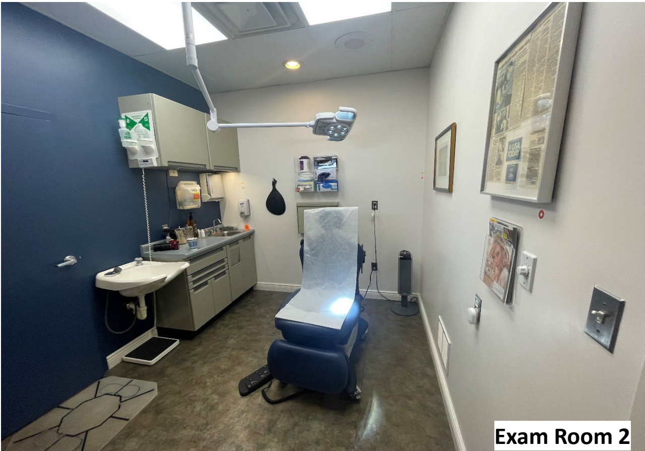
Exam Room 2