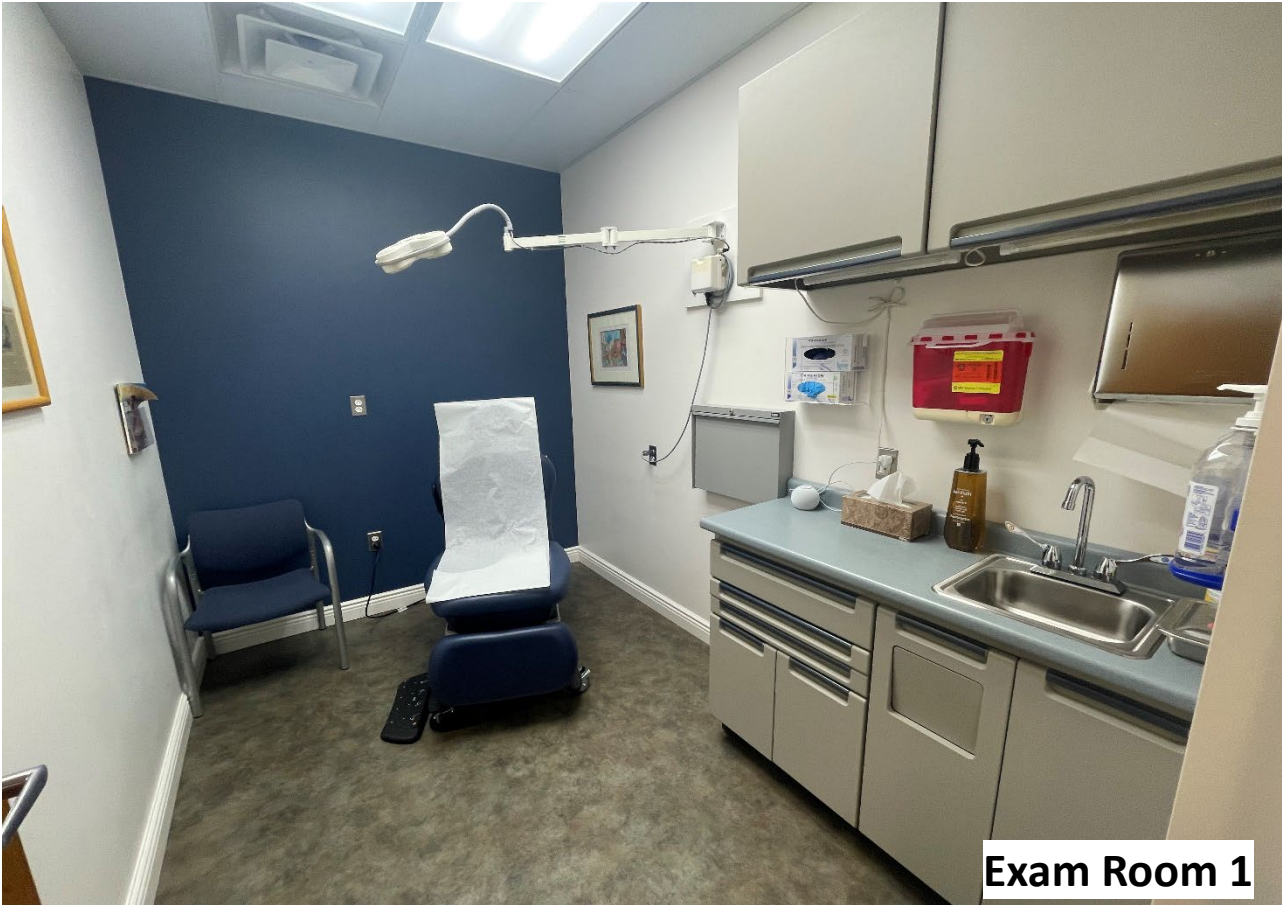
Exam Room 1