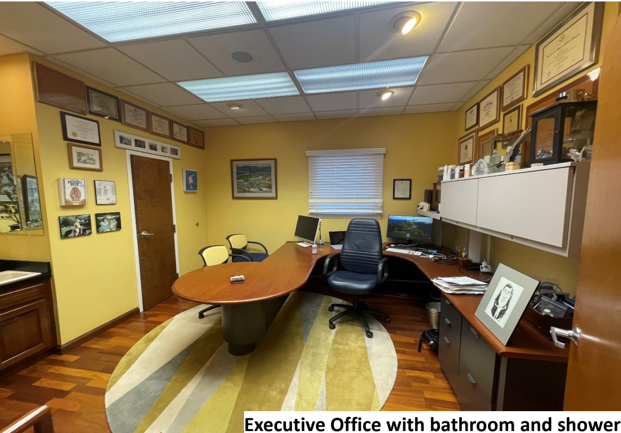
Executive Office with bathroom and shower