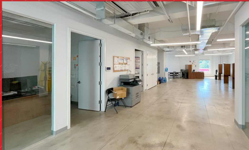
Floor Plan not to scale, for display purposes only