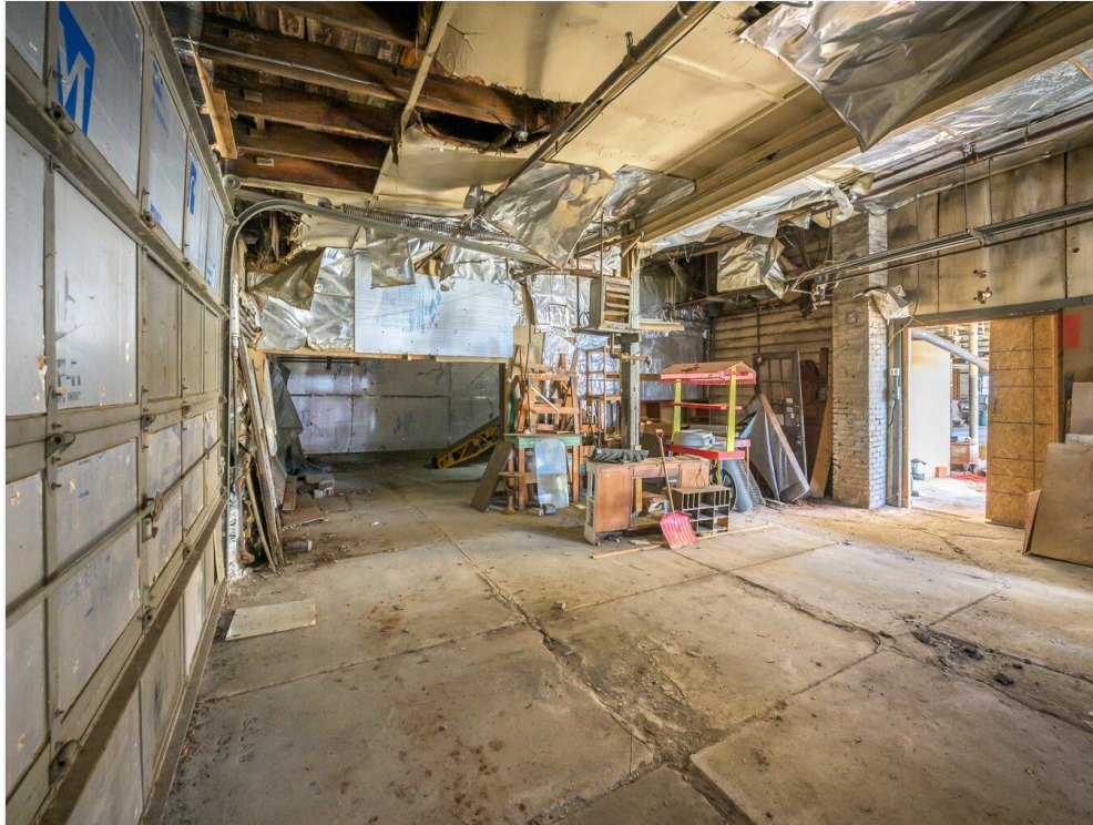
1st Fl Rear Garage - 513-515 Columbia Street, Commercial Building For Sale, Hudson NY