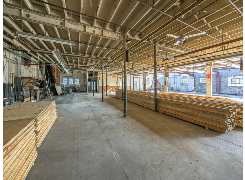
1st Fl - 513-515 Columbia Street, Commercial Building For Sale, Hudson NY