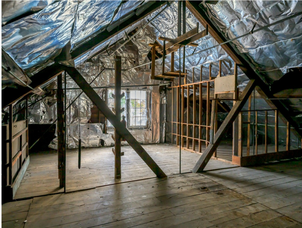
3rd Fl Storage - 513-515 Columbia St Hudson NY