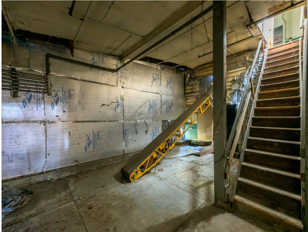
1st Fl Rear Garage - 513-515 Columbia Street, Commercial Building For Sale, Hudson NY