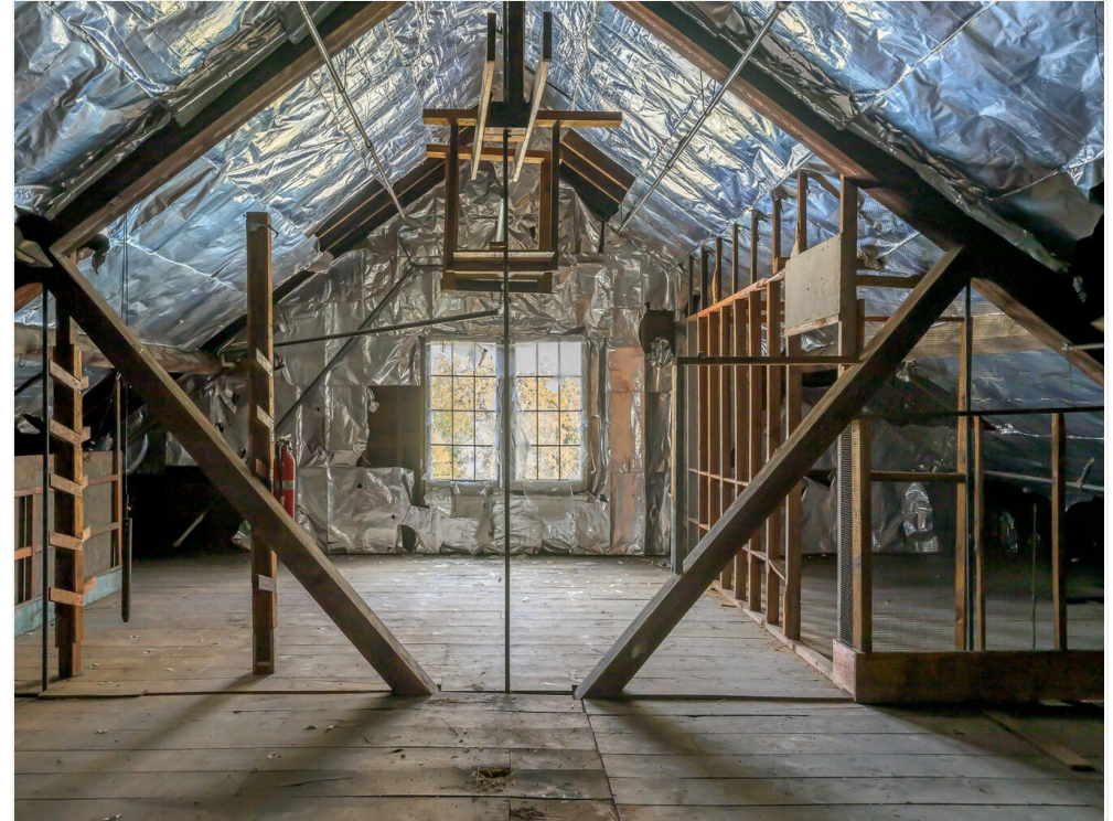
3rd Fl Storage - 513-515 Columbia St Hudson NY