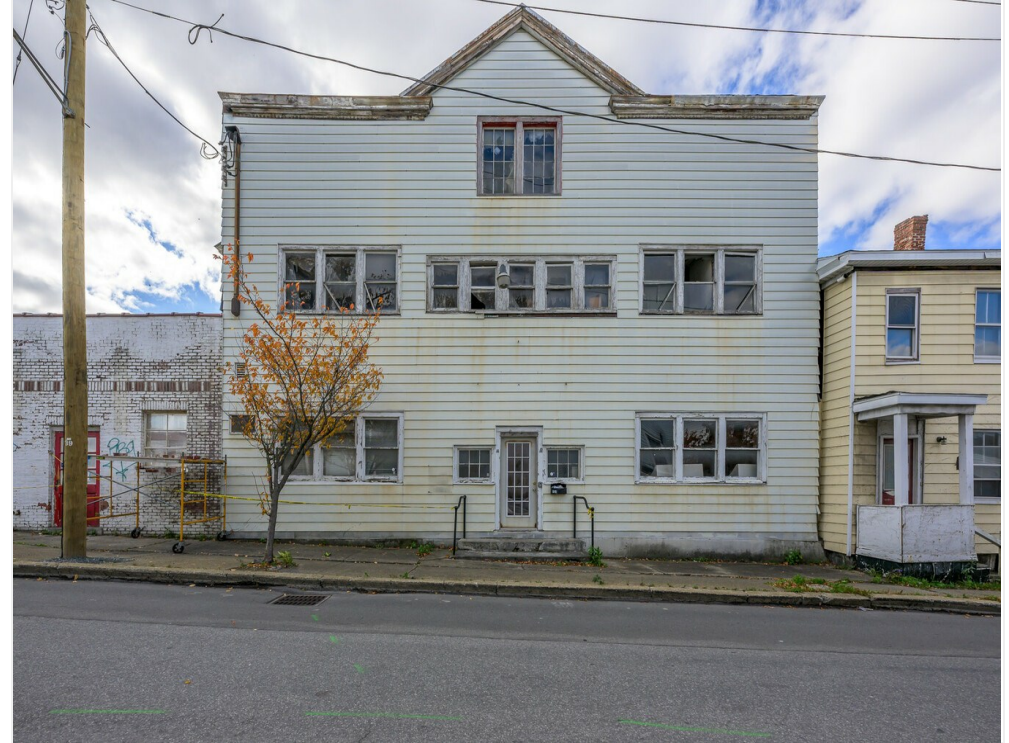
Exterior Front -513-515 Columbia Street, Commercial Building For Sale, Hudson NY