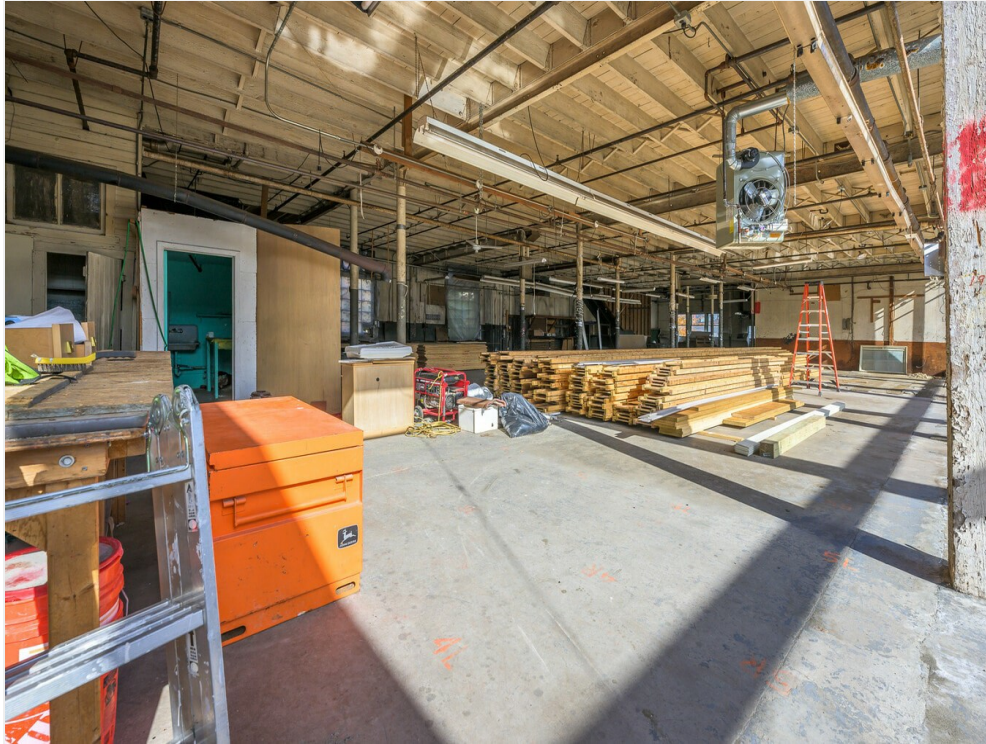
1st Fl - 513-515 Columbia Street, Commercial Building For Sale, Hudson NY