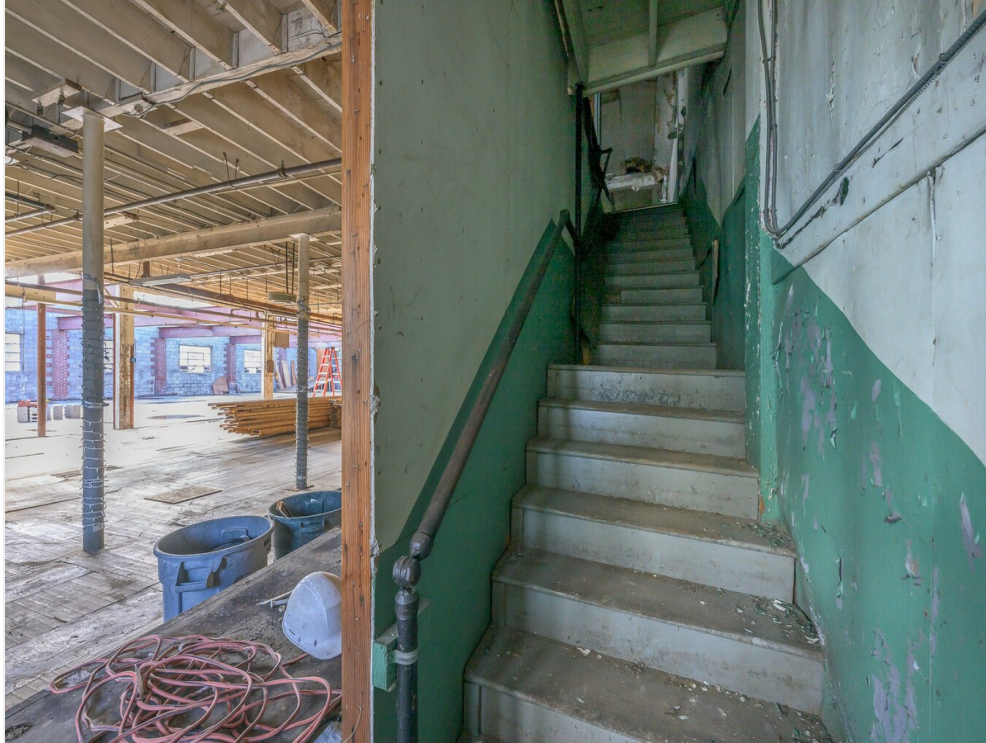
1st Fl - 513-515 Columbia Street, Commercial Building 513 Columbia St Hudson NY 12534-99414