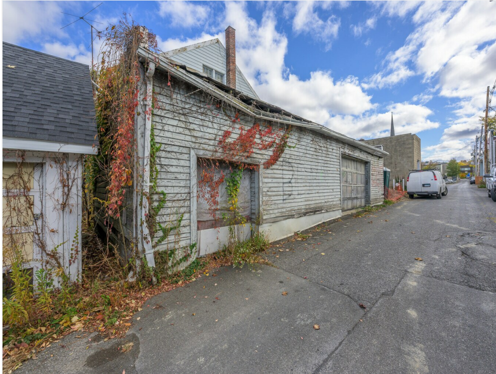
Exterior Rear Garage