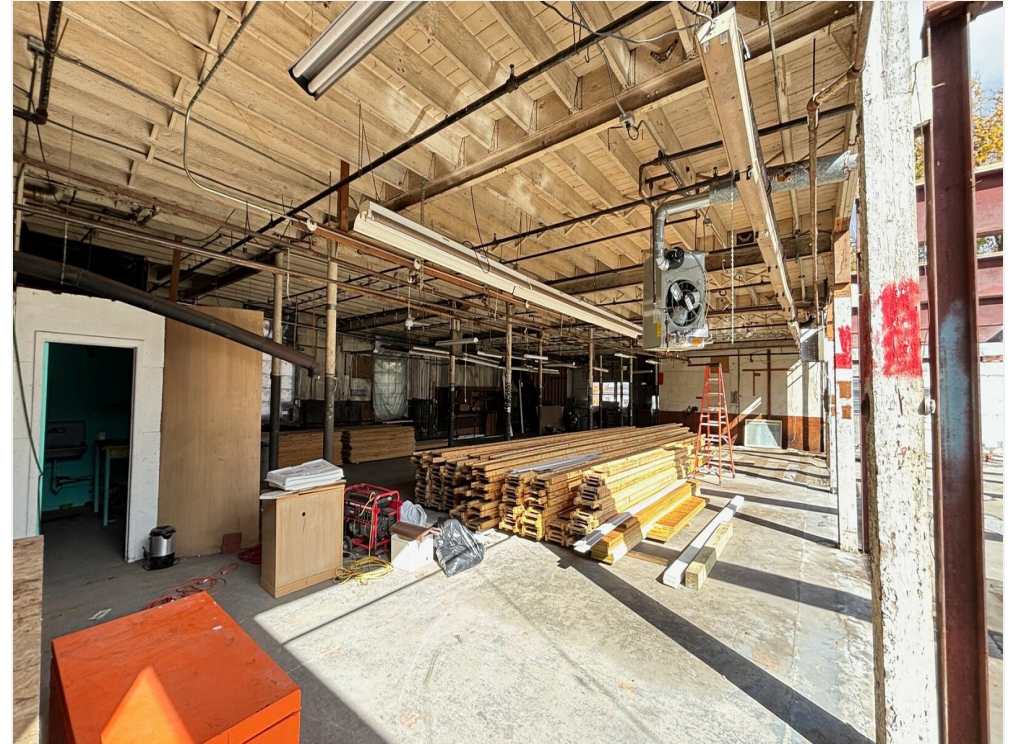
1st Fl - 513-515 Columbia Street, Commercial Building For Sale, Hudson NY