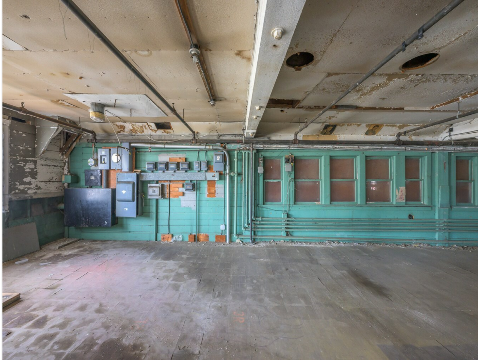
2nd Fl - 513-515 Columbia St Hudson NY