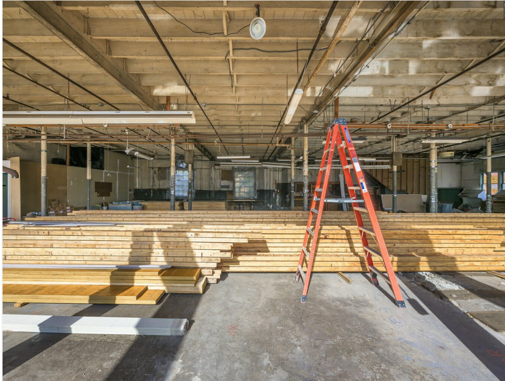
1st Fl - 513-515 Columbia Street, Commercial Building For Sale, Hudson NY