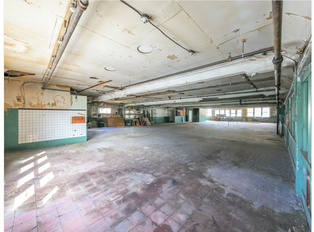
2nd Fl - 513-515 Columbia St Hudson NY