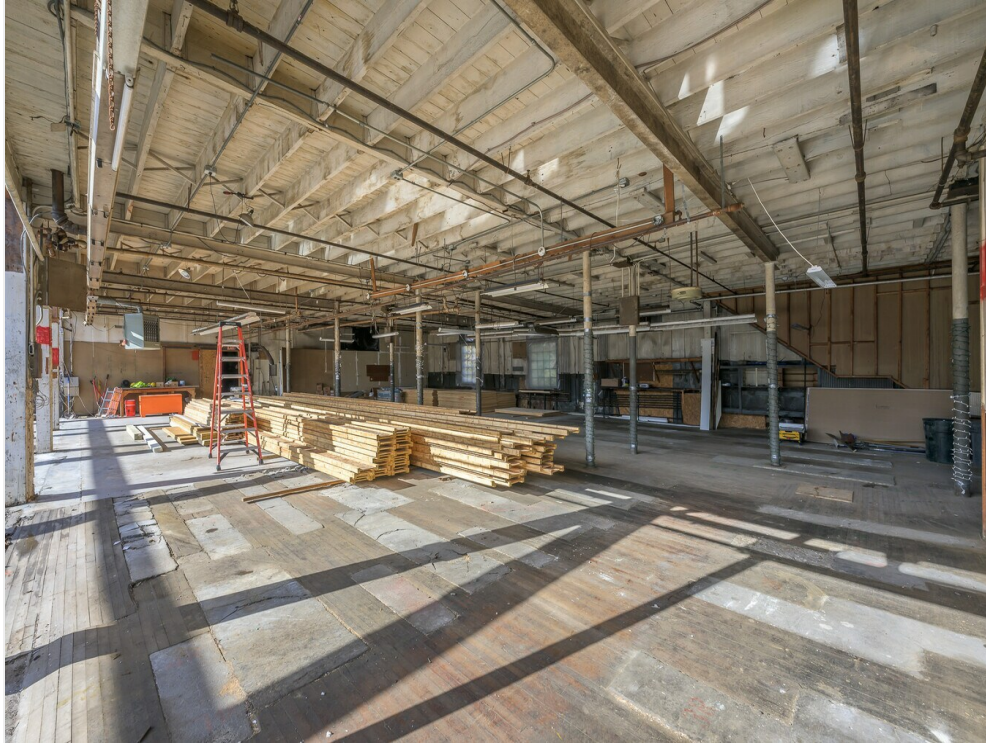
1st-Floor - 513-515 Columbia Street, Commercial Building For Sale, Hudson NY