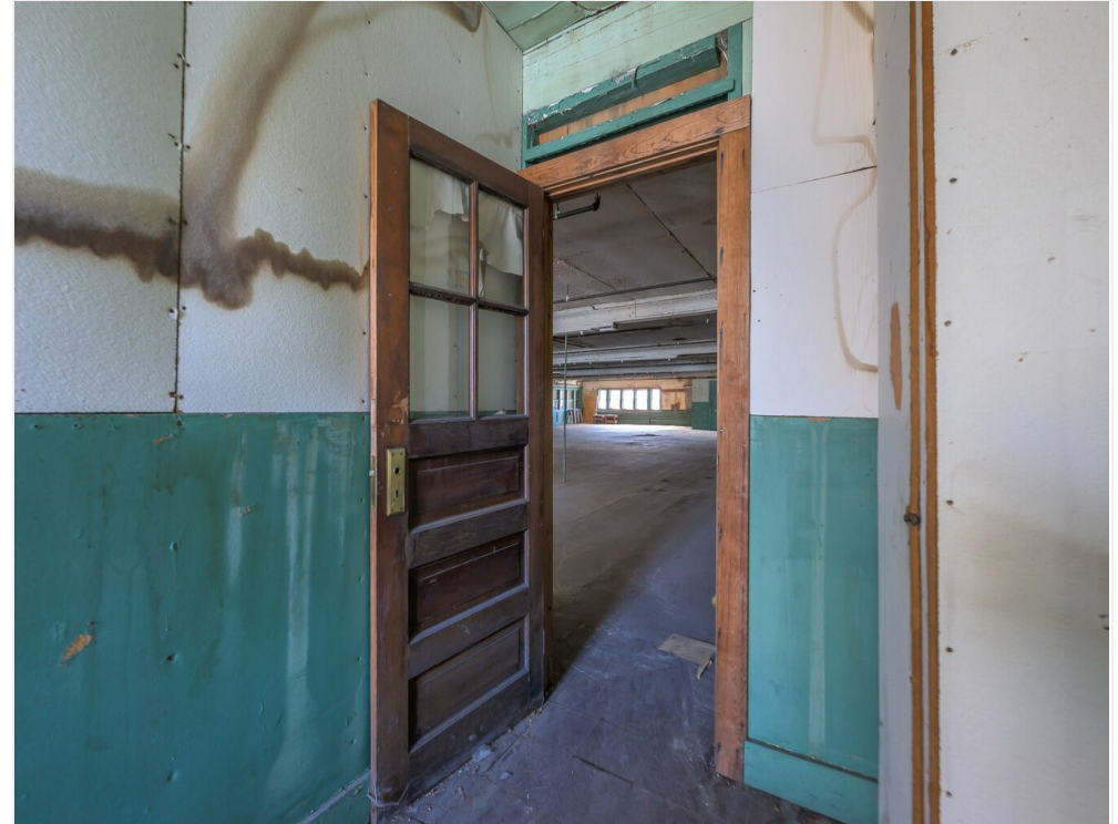
2nd Fl Office - 513-515 Columbia St Hudson NY