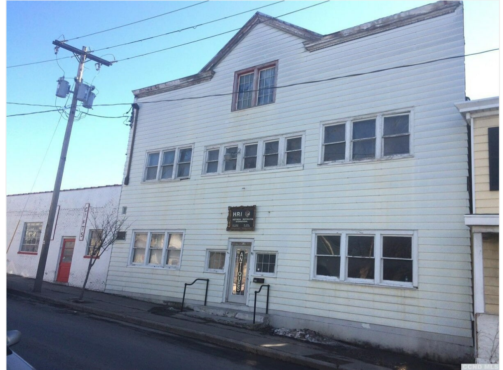
Exterior Front -513-515 Columbia Street, Commercial Building For Sale, Hudson NY