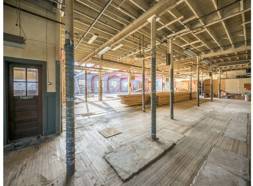
First Floor Interior - 513-515 Columbia Street, Co1st-Floor Building For Sale, Hudson NY