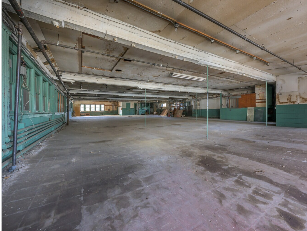
2nd Fl - 513-515 Columbia St Hudson NY