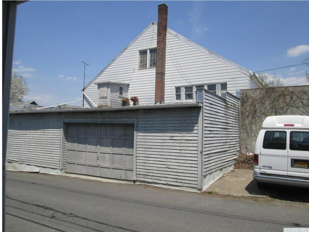
Exterior Rear Garage