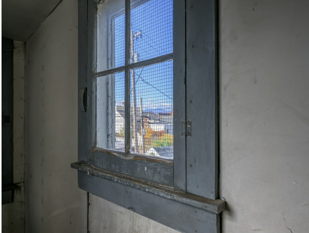
3rd Fl - 513 Columbia St Hudson NY 12534-99516