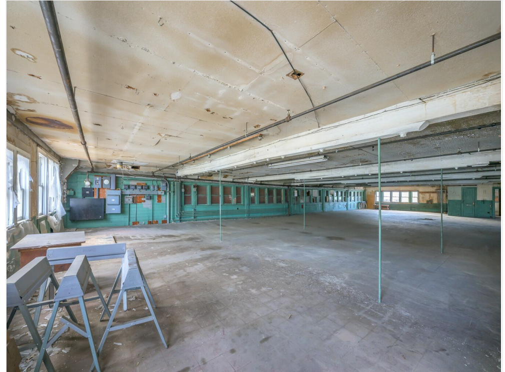
2nd Fl - 513-515 Columbia St Hudson NY