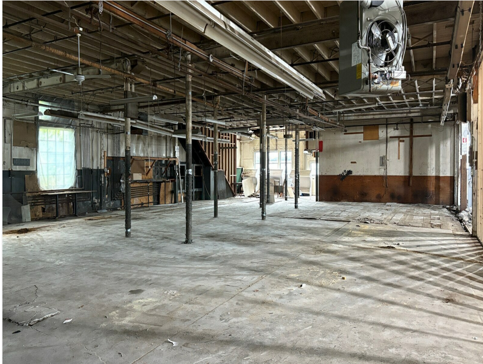
1ST Floor Interior