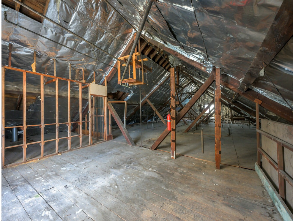
3rd Fl Storage - 513-515 Columbia St Hudson NY