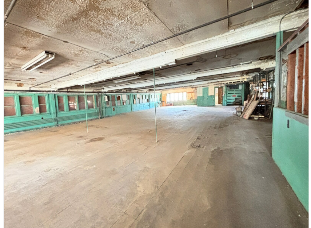
2nd Fl - 513-515 Columbia St Hudson NY