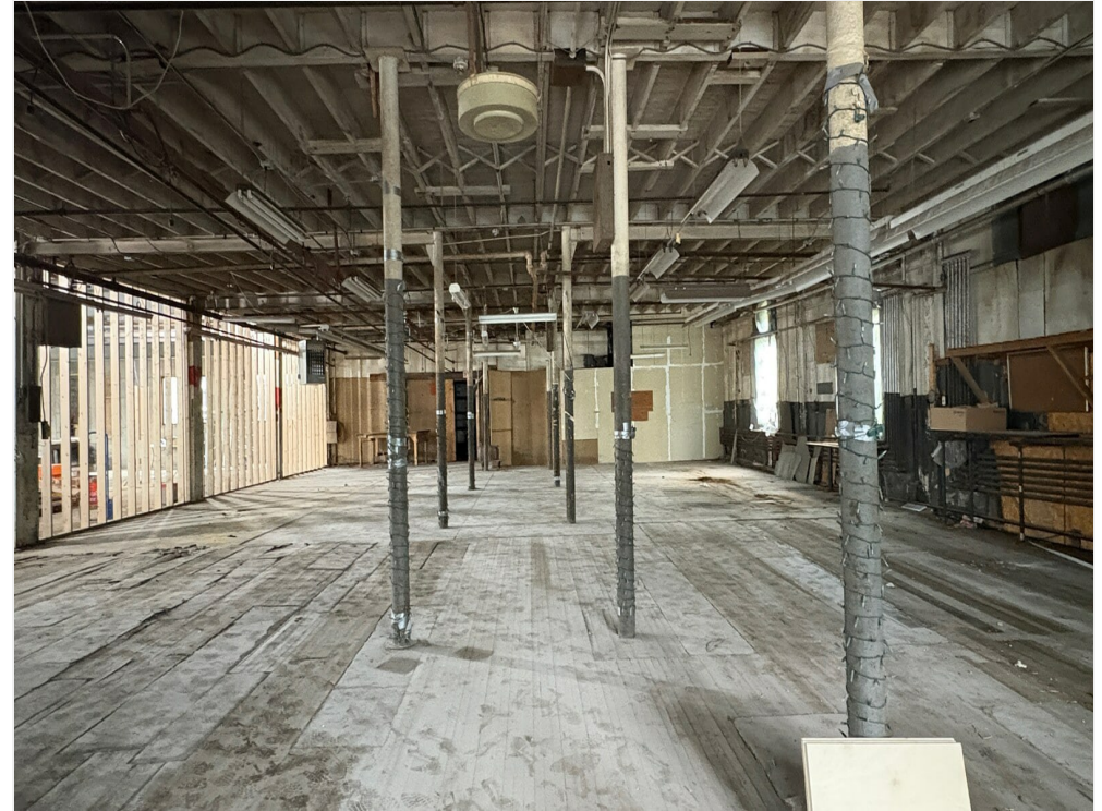
1ST Floor Interior