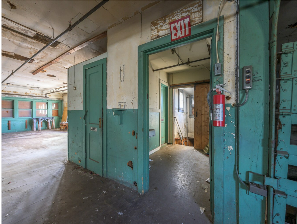
2nd Fl Rear Exit - 513-515 Columbia St Hudson NY