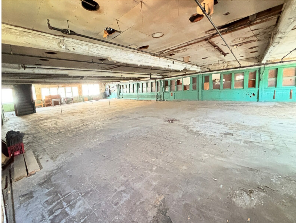
2nd Fl - 513-515 Columbia St Hudson NY