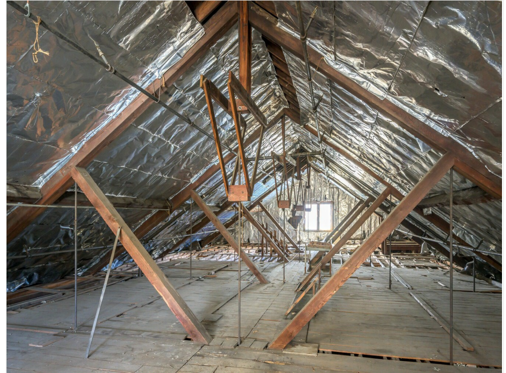
3rd Fl - 513-515 Columbia St Hudson NY