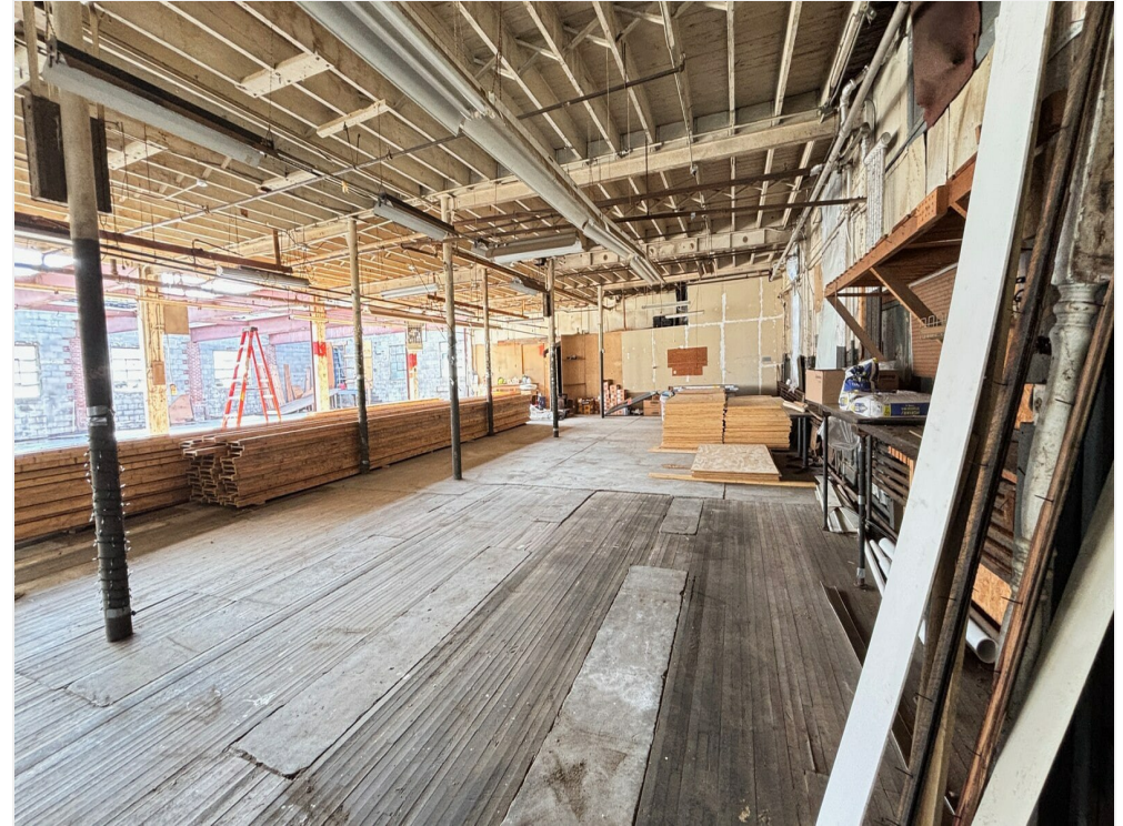
1st Fl - 513-515 Columbia Street, Commercial Building For Sale, Hudson NY