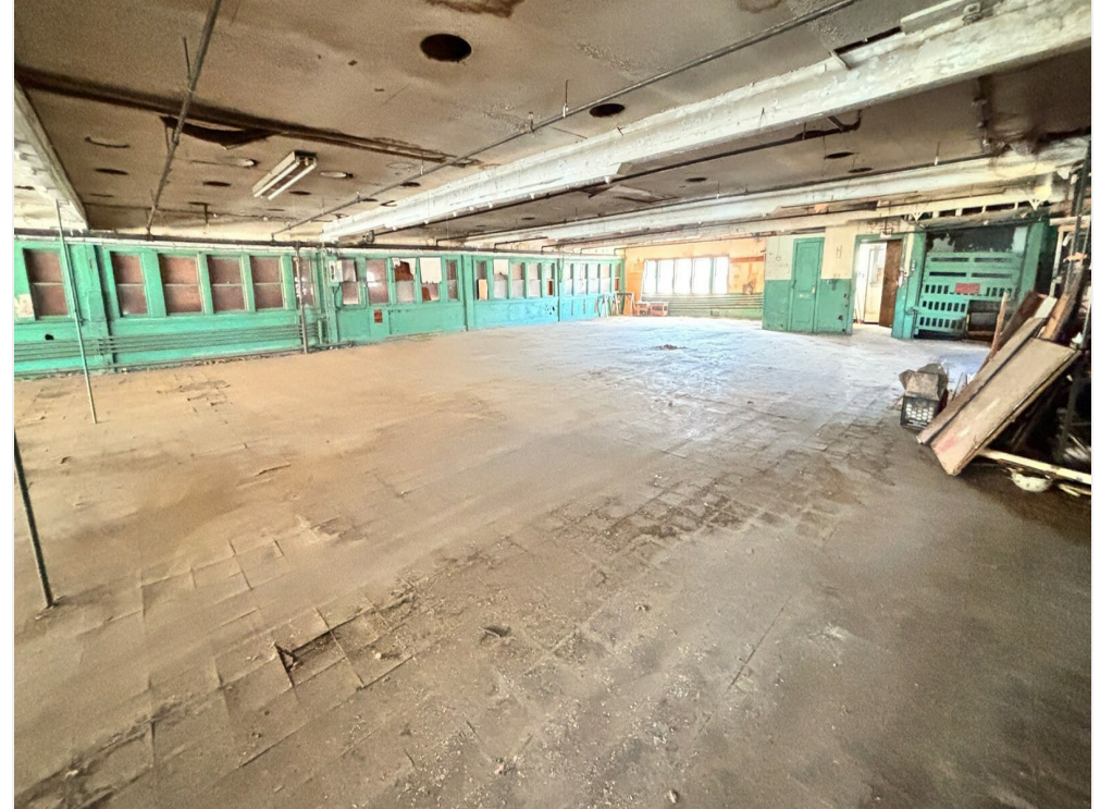
2nd Fl - 513-515 Columbia St Hudson NY