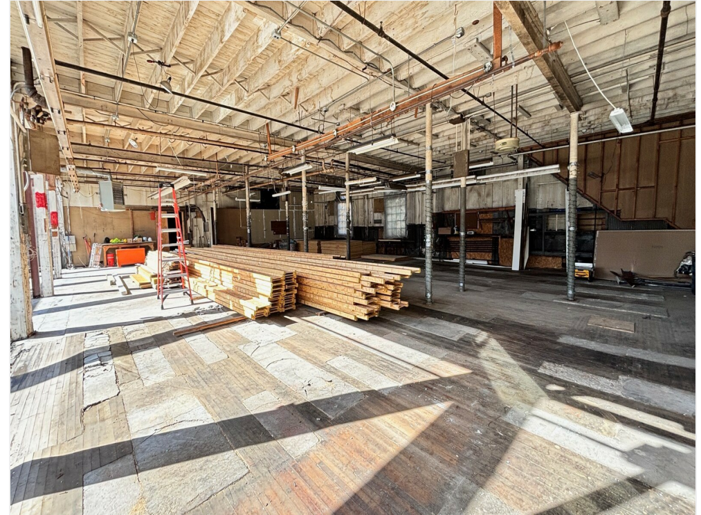
1st Fl - 513-515 Columbia Street, Commercial Building For Sale, Hudson NY