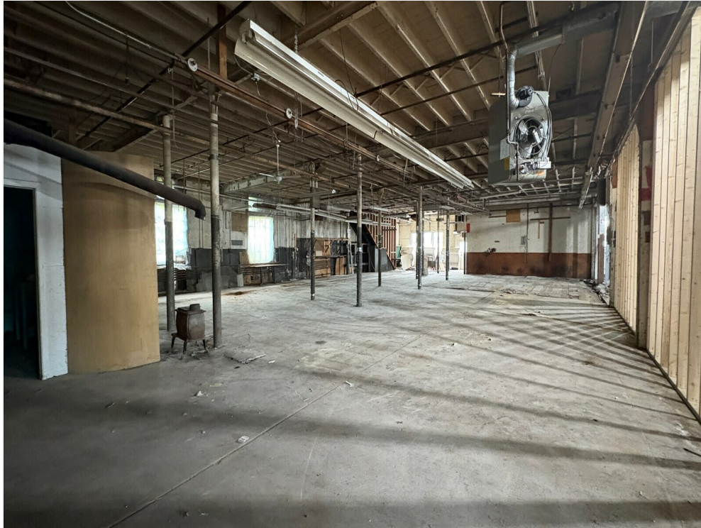
1ST Floor Interior