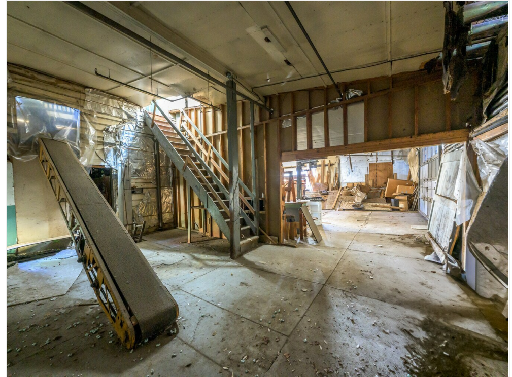
1st Fl Rear Garage - 513-515 Columbia Street, Commercial Building For Sale, Hudson NY