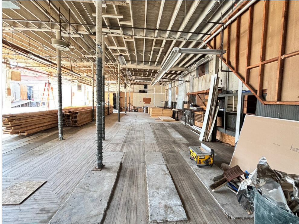
1st Fl - 513-515 Columbia Street, Commercial Building For Sale, Hudson NY