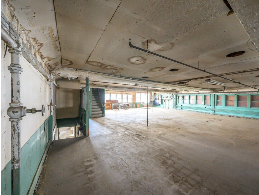
2nd Fl - 513-515 Columbia St Hudson NY