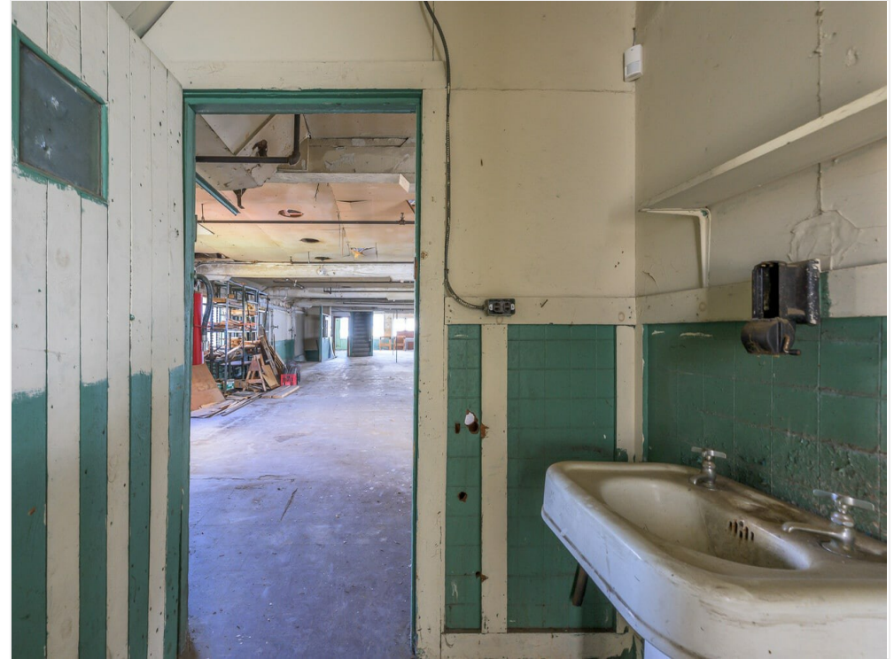
2nd Fl Bathroom - 513-515 Columbia St Hudson NY