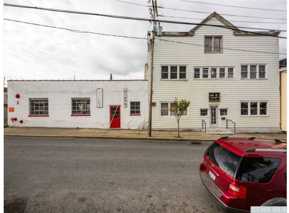
Exterior Front -513-515 Columbia Street, Commercial Building For Sale, Hudson NY