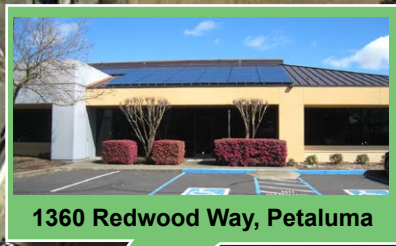
1360 Redwood Way, Petaluma