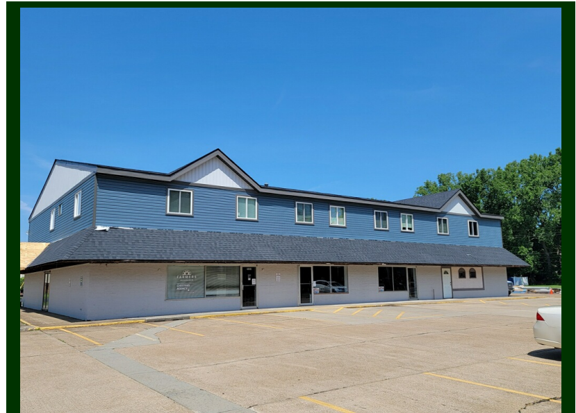
5800 Andrews Rd., Mentor-on-the-Lake, OH 44060

No warranty or representation, express or implied, is made as to the accuracy of the information contained herein. It is submitted subject to errors, omissions, price changes, rental or other conditions, withdrawal without notice, and to any special listing conditions imposed by our client.