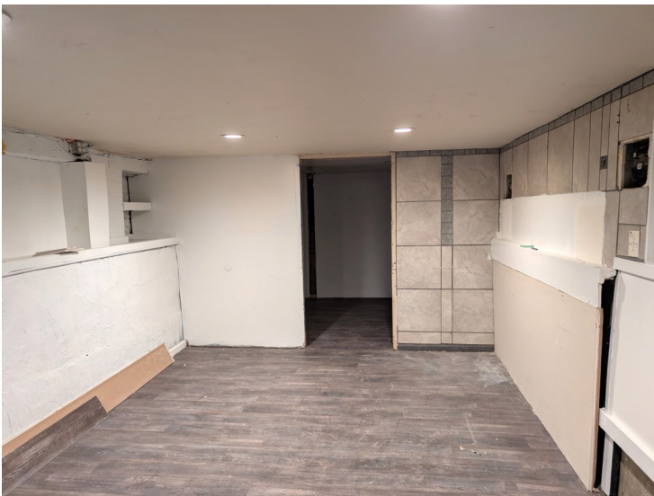
Lower Level / Basement