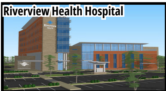
Riverview Health Hospital