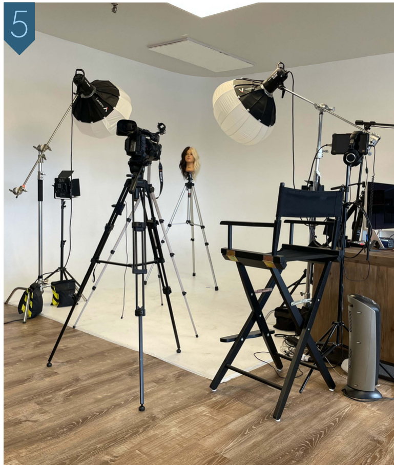
1: Office | 2: View of Farmers Market from suite 260 | 3: Built in Kitchen + Cabinets | 4: Common Area Patio Facing Cedros | 5: Photo Studio Set Up