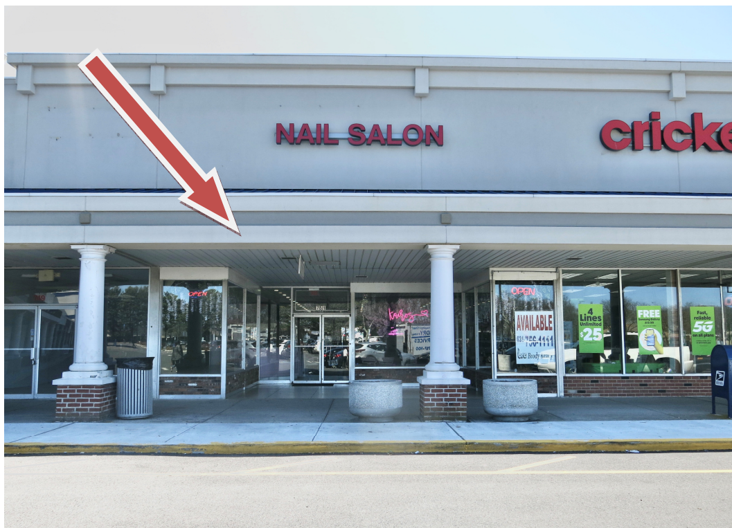
RIVERHEAD PLAZA | RIVERHEAD, NEW YORK