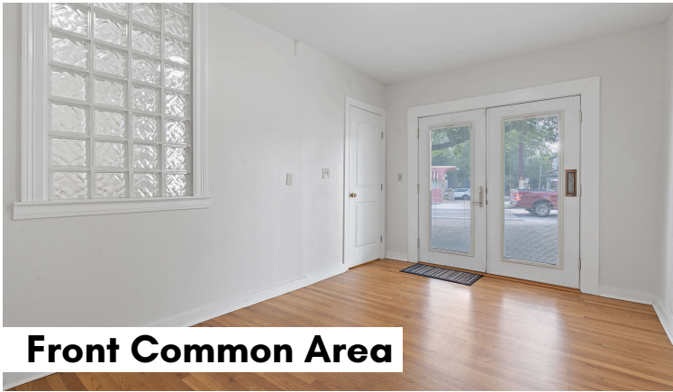
Front Common Area

The versatile space is ideal for medical offices, professional businesses such as lawyers, accountants, and psychologists, as well as wellness centers, cafes, and boutiques.