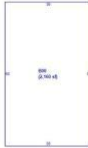
Putnam County Property Appraiser