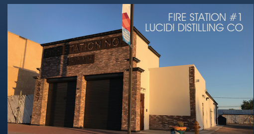
FIRE STATION #1 LUCIDI DISTILLING CO