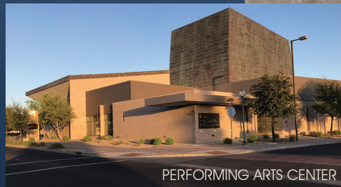
PERFORMING ARTS CENTER