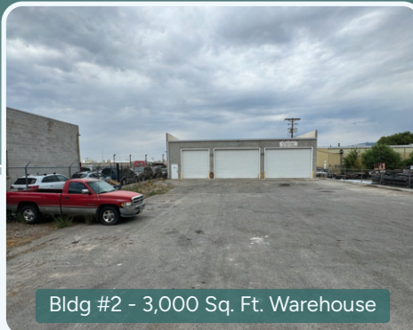
Bldg #2 - 3,000 Sq. Ft. Warehouse