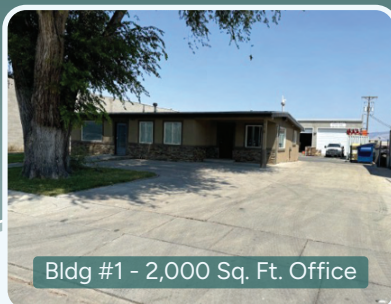
Bldg #1 - 2,000 Sq. Ft. Office

Lease Rate: $7,500.00 | NNN CAM: $0.19/PSF