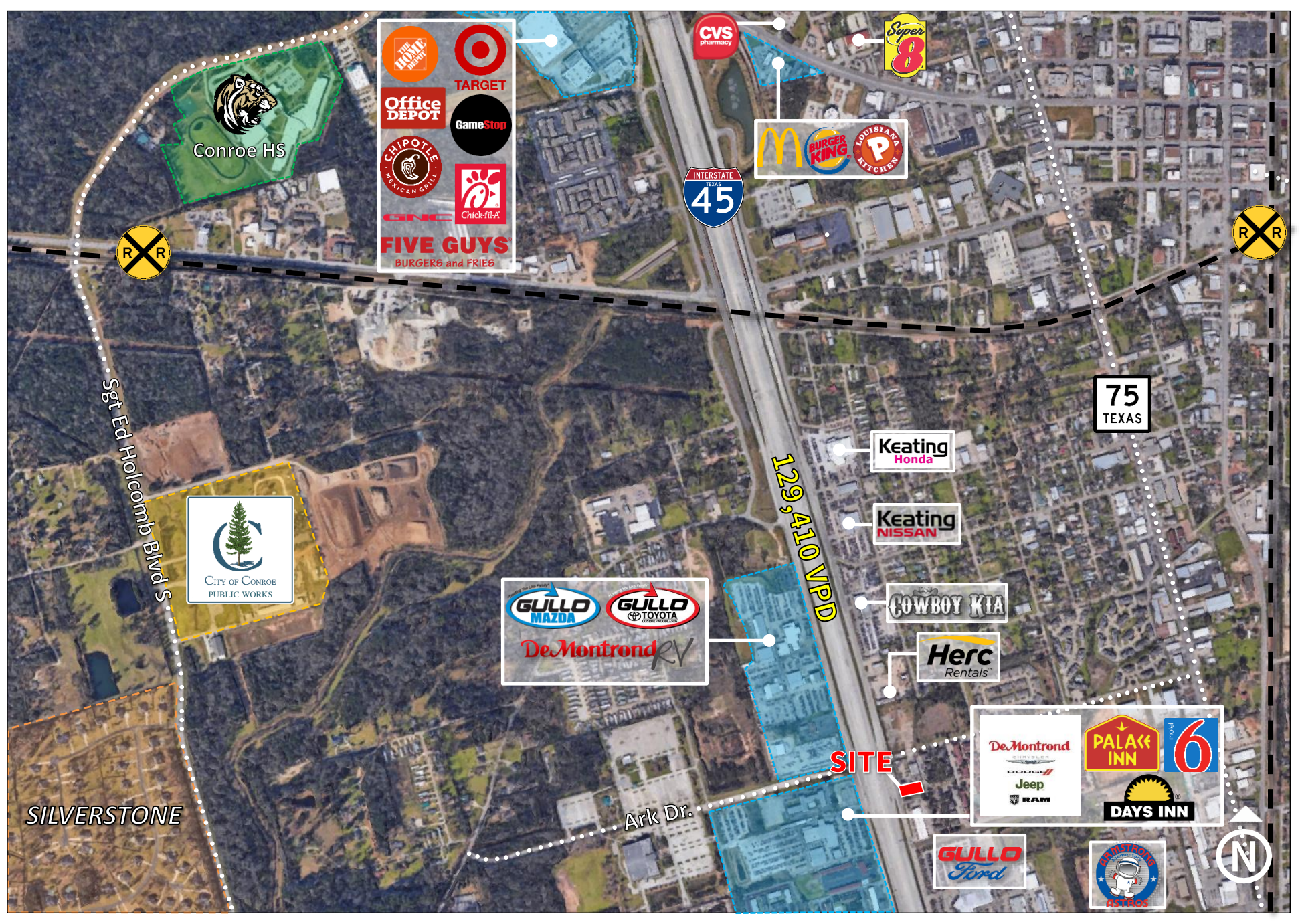
Although information has been obtained from sources deemed reliable, JLL does not make any guarantees, warranties or representations, express or implied, as to the completeness or accuracy as to the information contained herein. Any projections, opinions, assumptions or estimates used are for example only. There may be differences between projected and actual results, and those differences may be material. JLL does not accept any liability for any loss or damage suffered by any party resulting from reliance on this information. If the recipient of this information has signed a confidentiality agreement with JLL regarding this matter, this information is subject to the terms of that agreement. ©2021 Jones Lang LaSalle IP, Inc. All rights reserved.