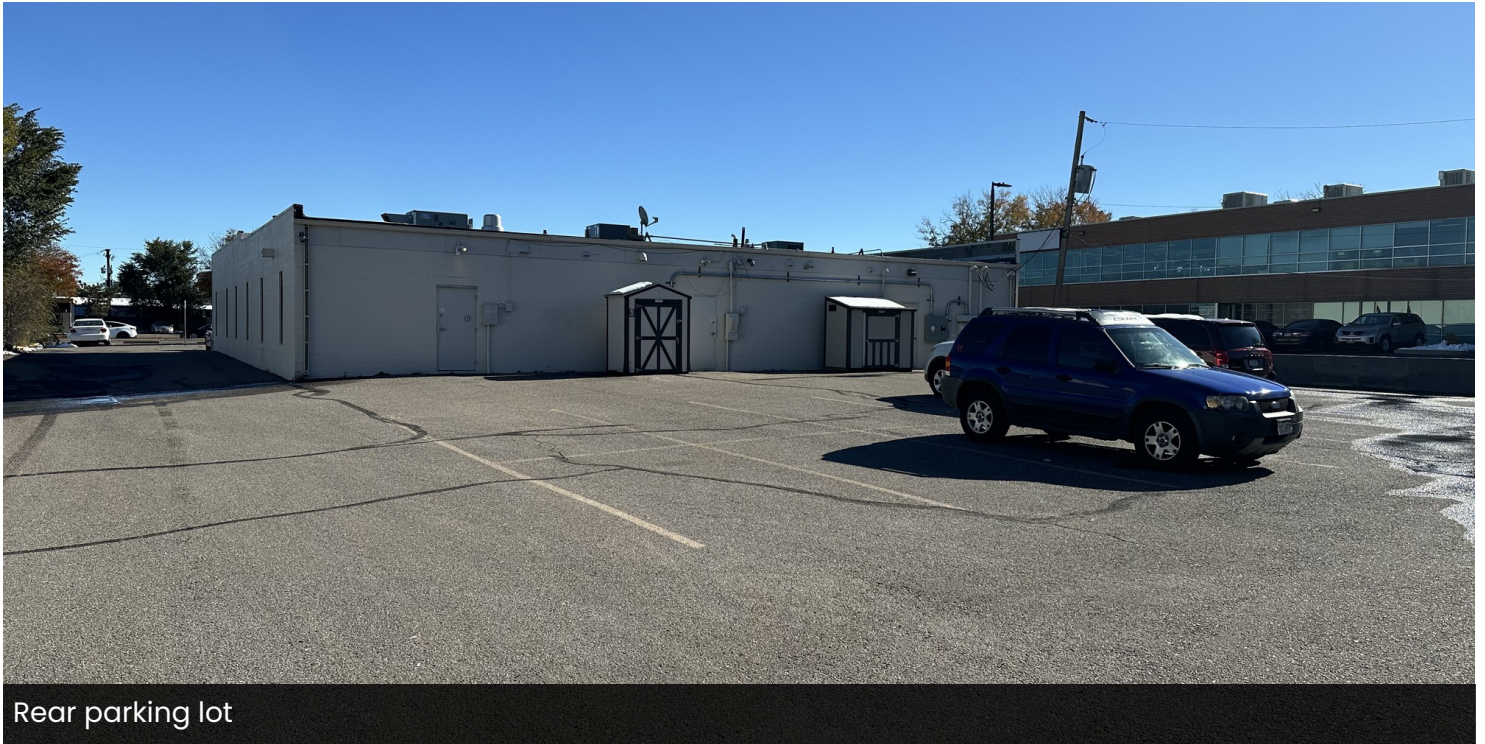
Rear parking lot