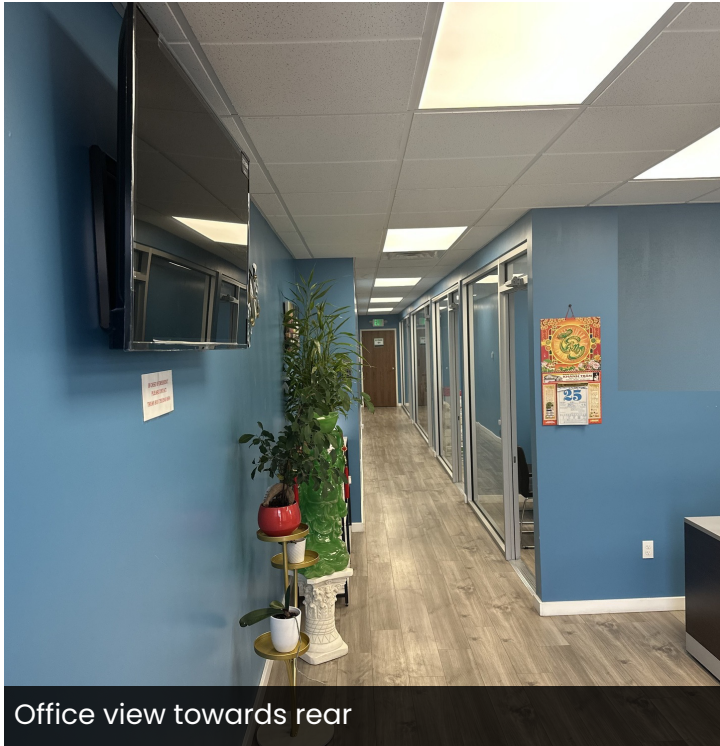
Office view towards rear