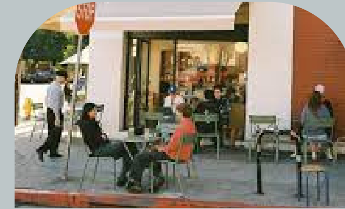
Canyon Coffee Popular neighborhood coffee shop