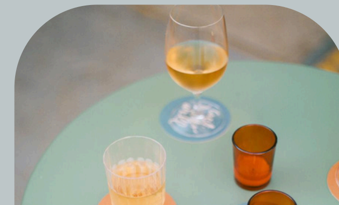
Bacetti Stylish Italian restaurant with fantastic wines.