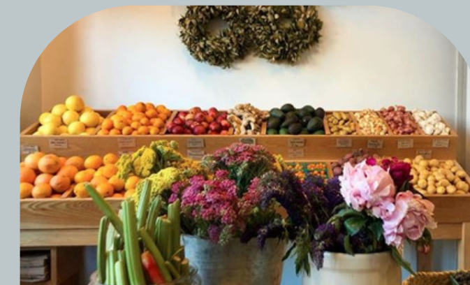
Cookbook LA Community green grocer specializing in responsibly grown & super tasty foods.