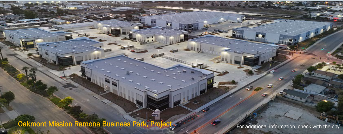
Oakmont Mission Ramona Business Park, Project

For additional information, check with the city