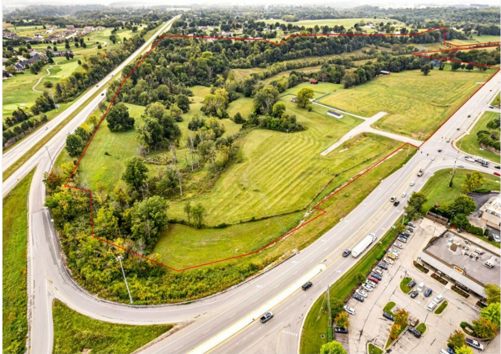
NOTE: BOUNDARY LINES ARE NOT EXACT