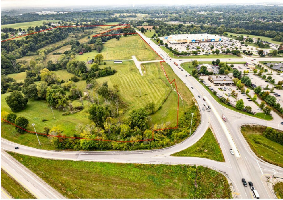
NOTE: BOUNDARY LINES ARE NOT EXACT