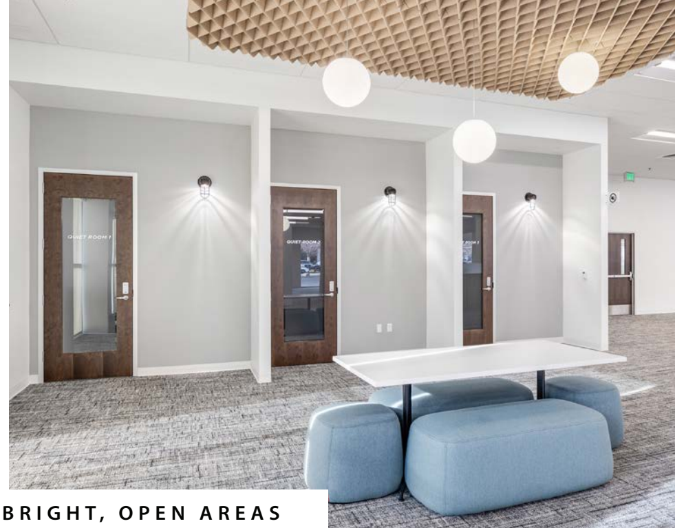
THOUGHTFUL REDESIGN WITH BRIGHT, OPEN AREAS