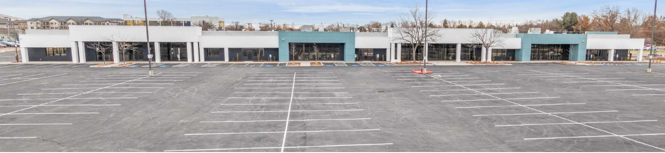
ABUNDANCE OF ON-SITE PARKING