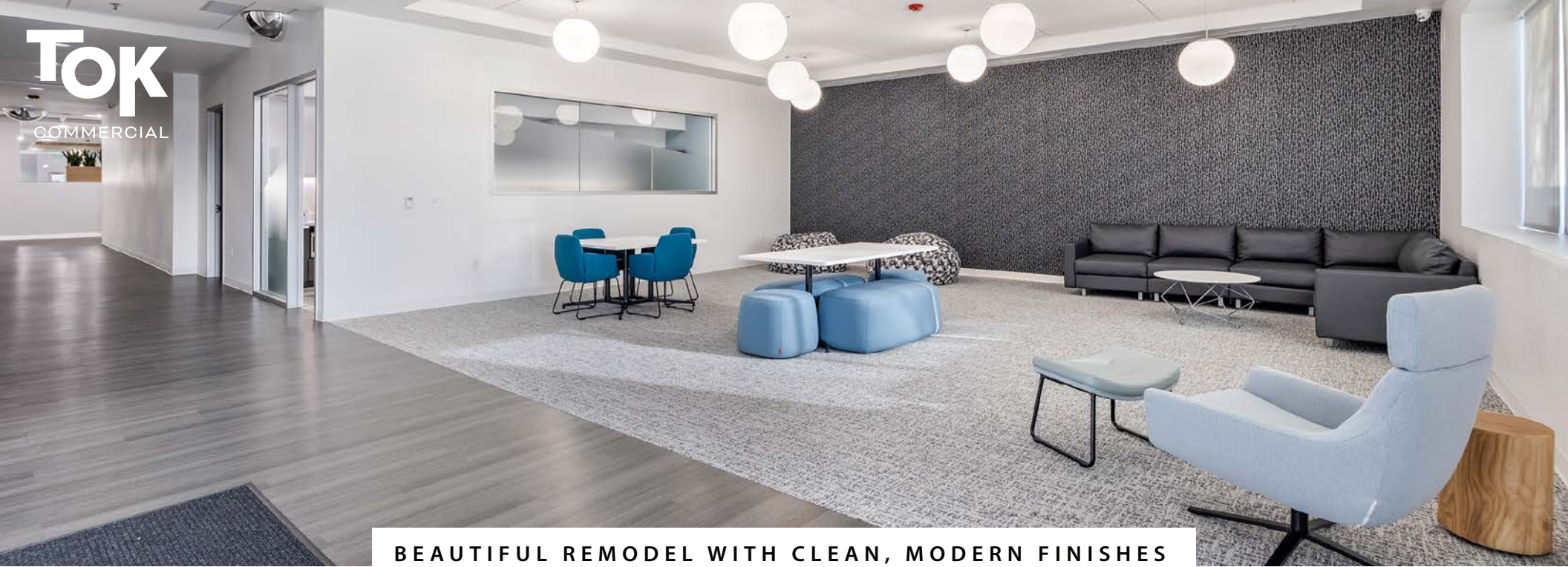
BEAUTIFUL REMODEL WITH CLEAN, MODERN FINISHES