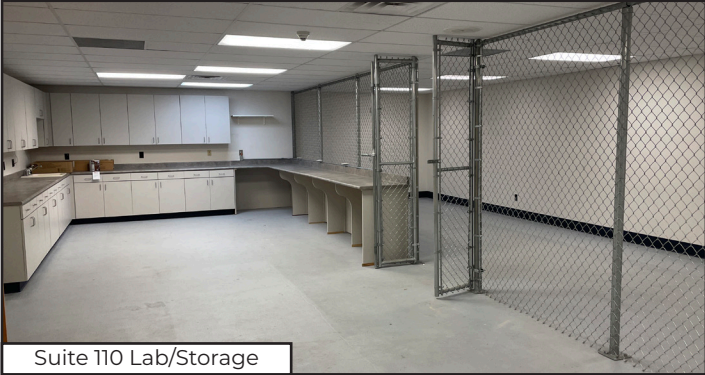
Suite 110 Lab/Storage