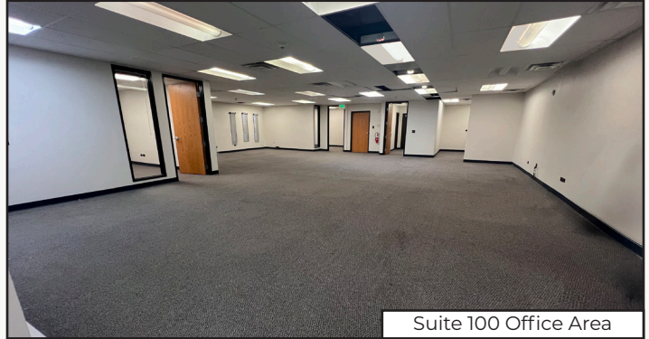
Suite 100 Office Area