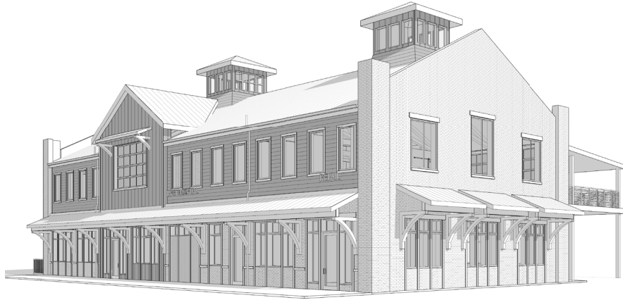
2 NW PERSPECTIVE