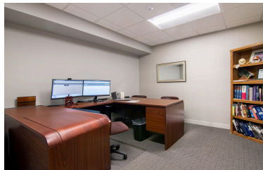
LARGE PRIVATE OFFICES