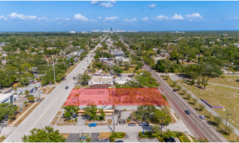
HIGH TRAFFIC CORRIDOR

IDEAL FOR PROFESSIONAL OFFICE FOR USERS SEEKING A TURN-KEY SPACE WITH FRONTAGE ON A HIGH-TRAFFIC CORRIDOR.