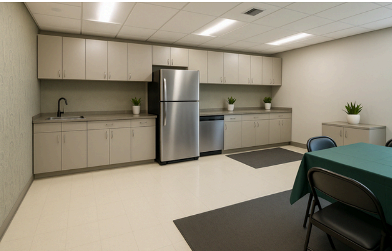
BREAK ROOM WITH KITCHEN