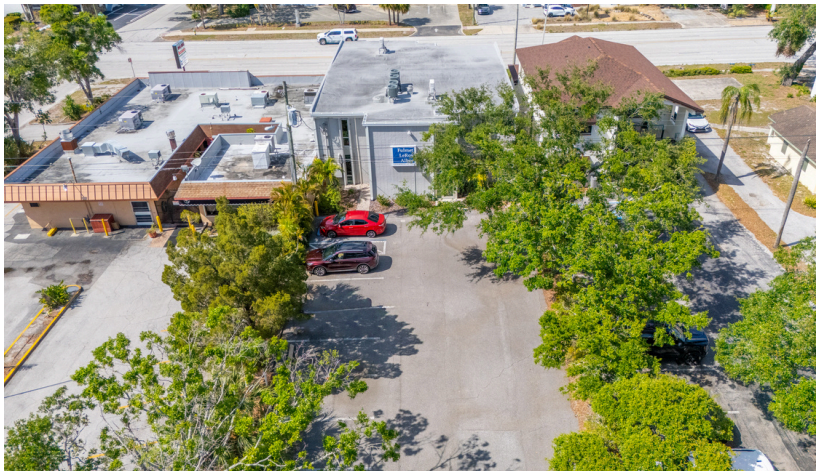
LARGE PARKING LOT