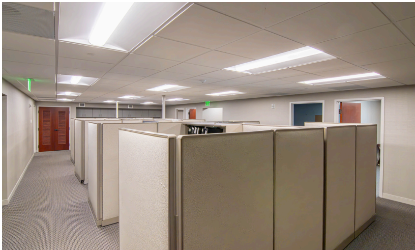
OPEN WORKSPACE & CUBICLES