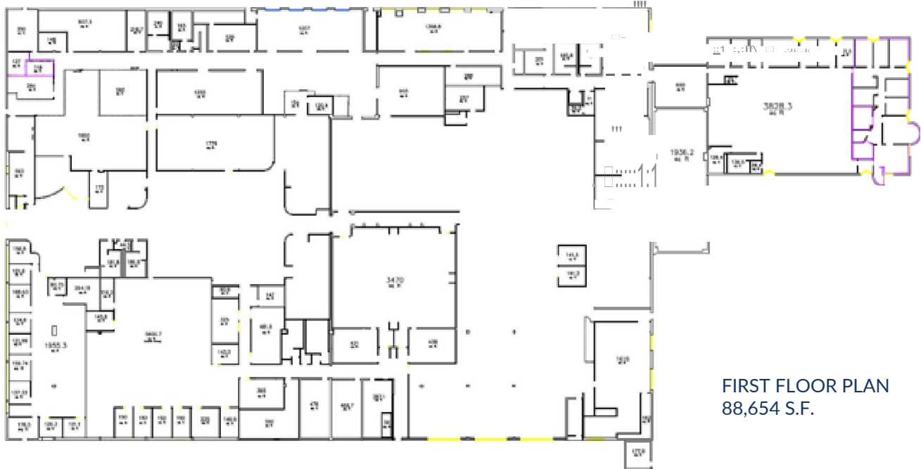
FIRST FLOOR PLAN 88,654 S.F.