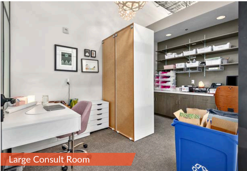
Large Consult Room