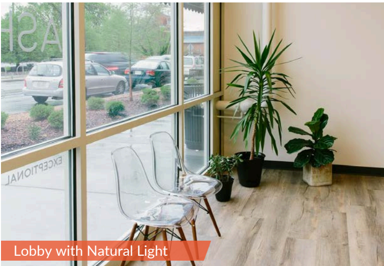
Lobby with Natural Light