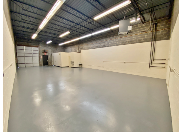
Sample Warehouse Interior