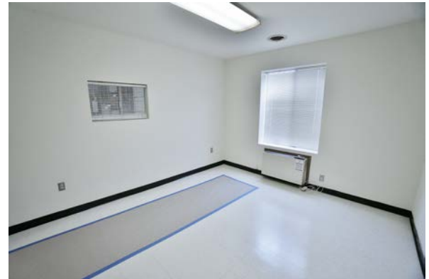
Sample Front Office