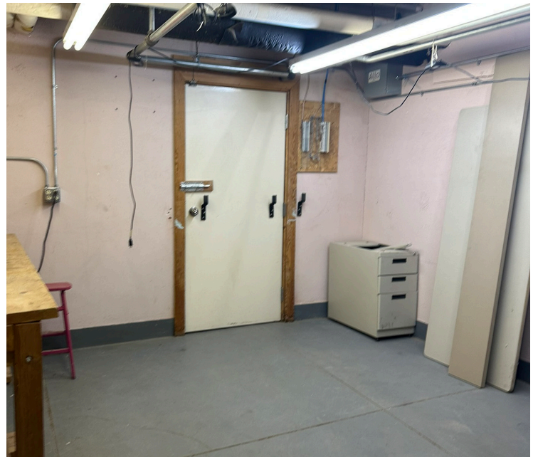
Unit #130 Basement Storage