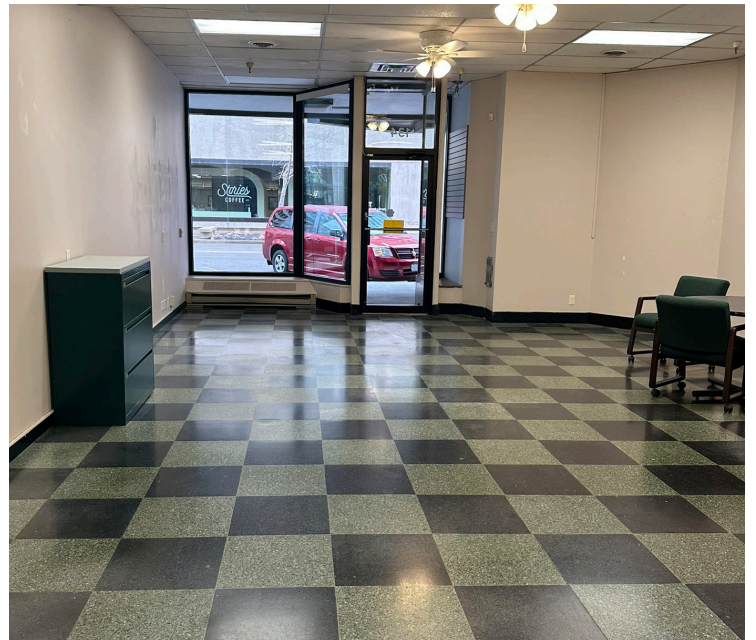
Unit #134 Street Entrance