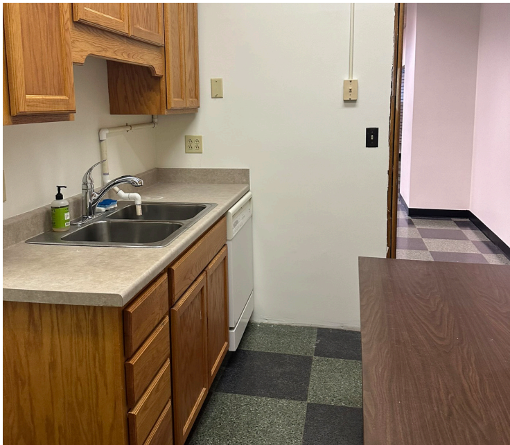
Unit #130 Kitchenette