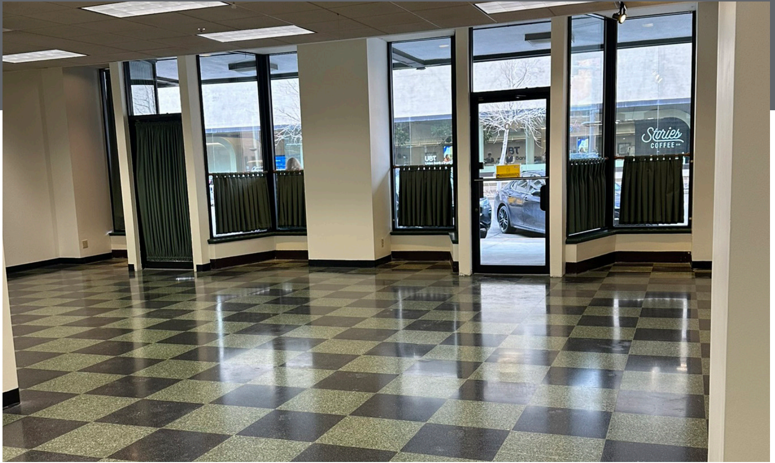
Unit #130 Open Area & Entrance