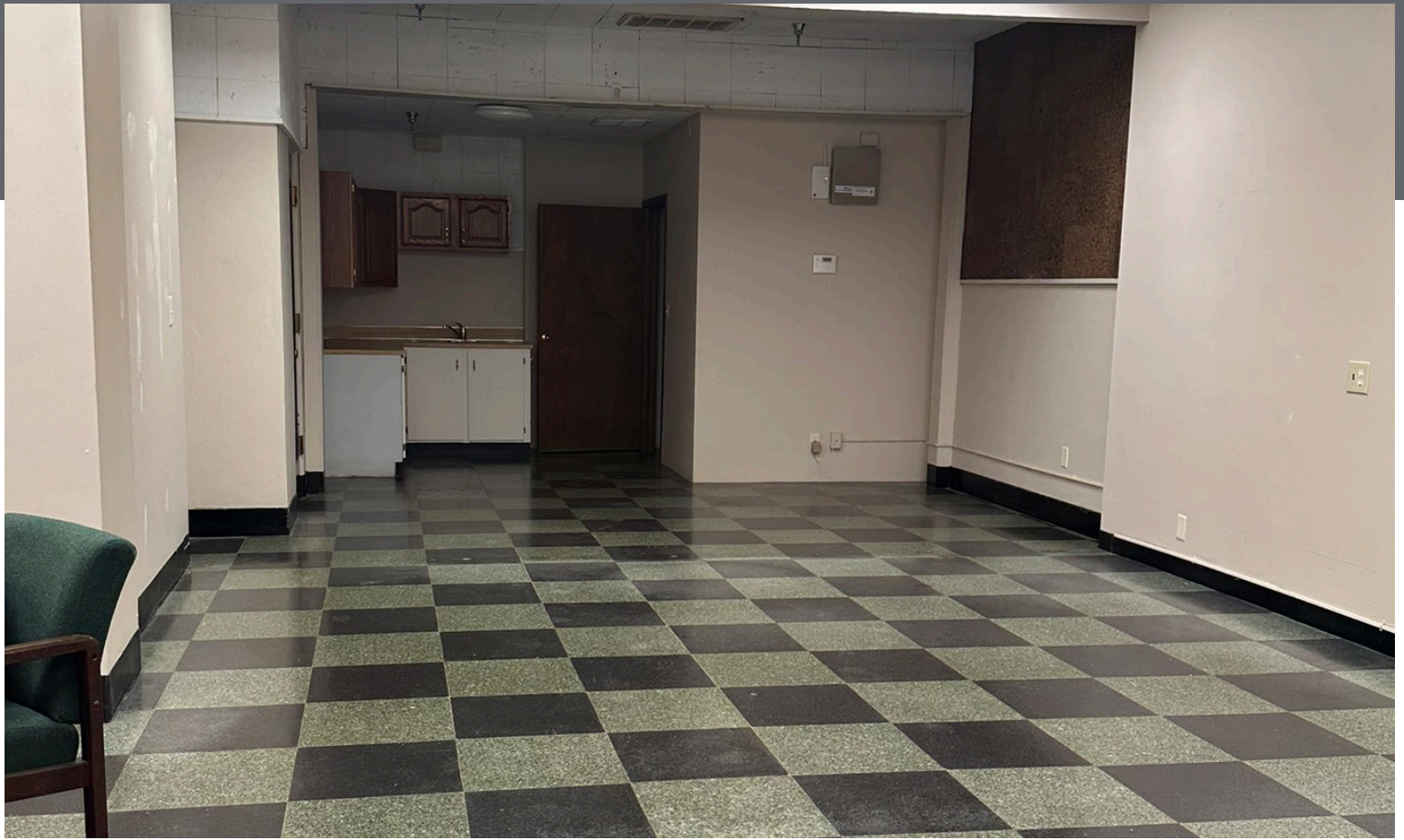
Unit #134 Open Area & Kitchenette