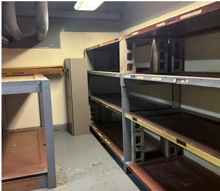
Unit #134 Basement Storage