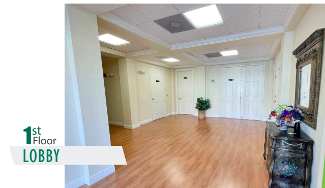
1 st Floor LOBBY