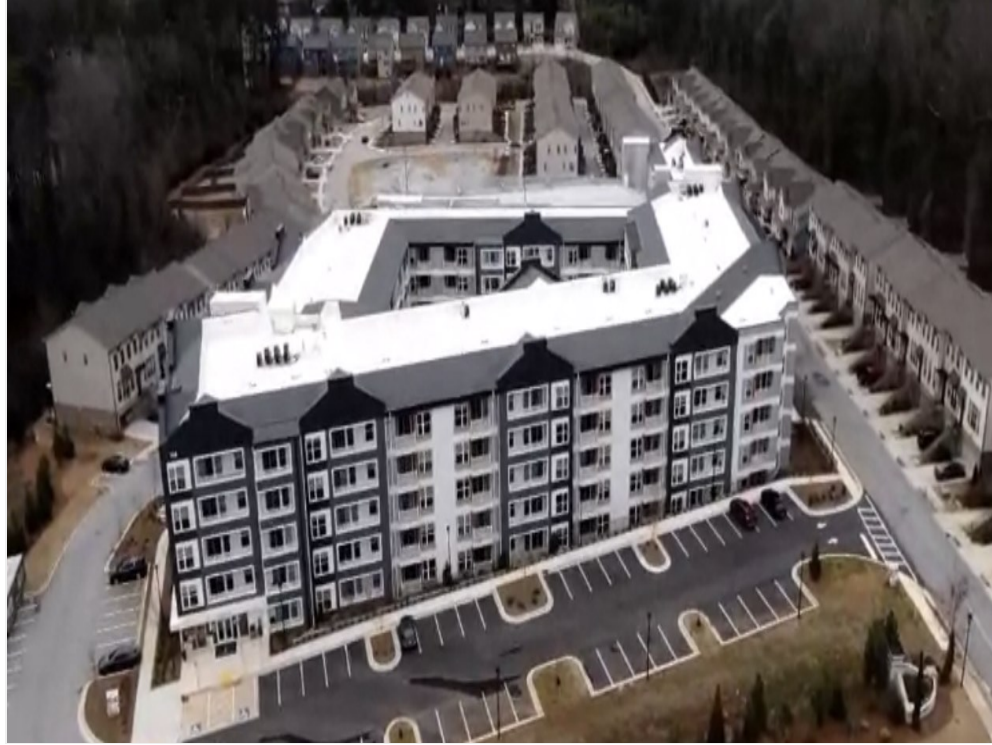
Picture of Site Aerial