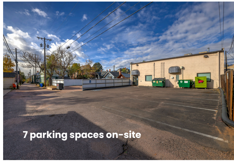
7 parking spaces on-site