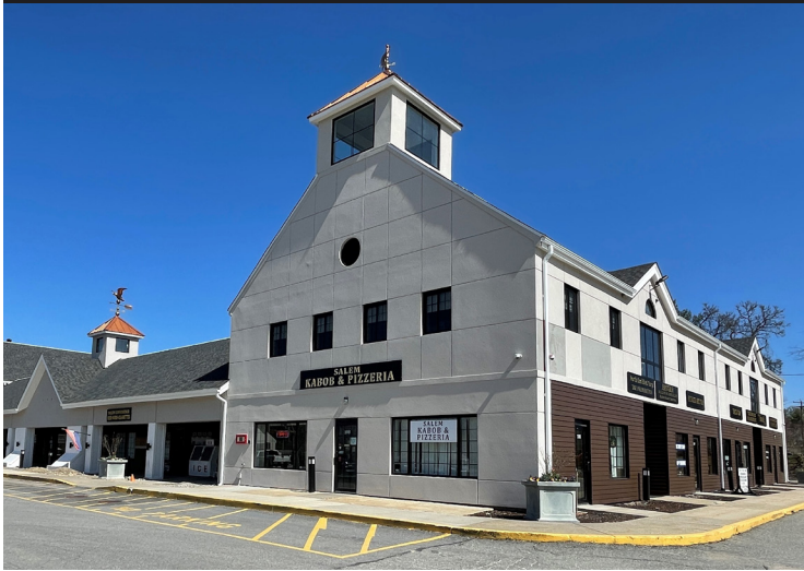
Main Building Picture