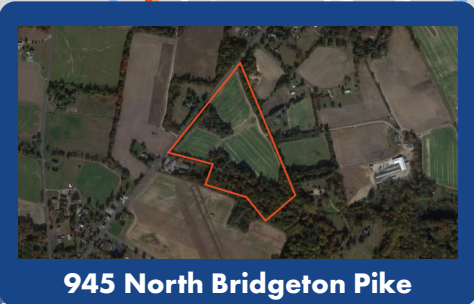
945 North Bridgeton Pike