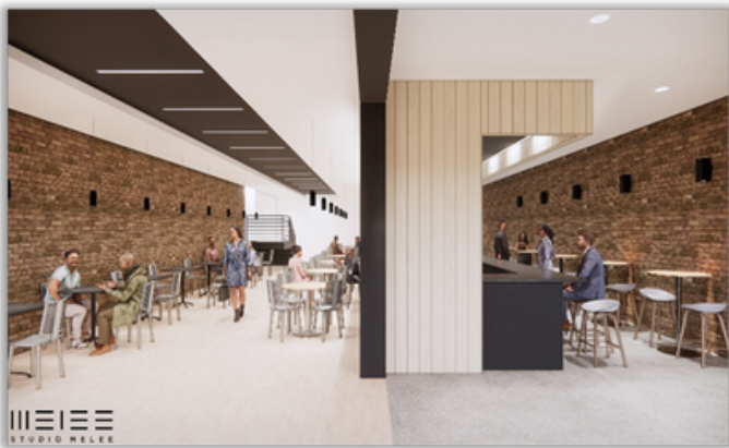
1st floor (conceptual renderings)