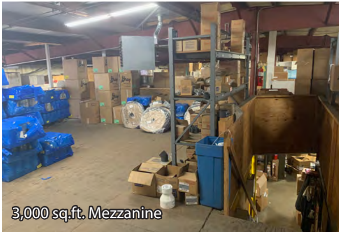
3,000 sq.ft. Mezzanine

3537 Merchandise Drive Rockford, Illinois 61109