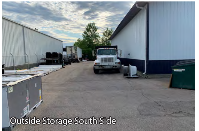
Outside Storage South Side