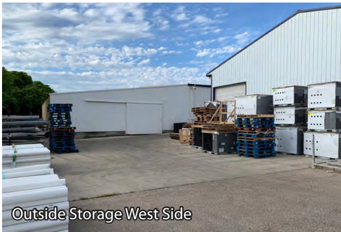
Outside Storage West Side