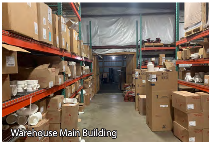
Warehouse Main Building