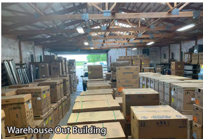
Warehouse Out Building