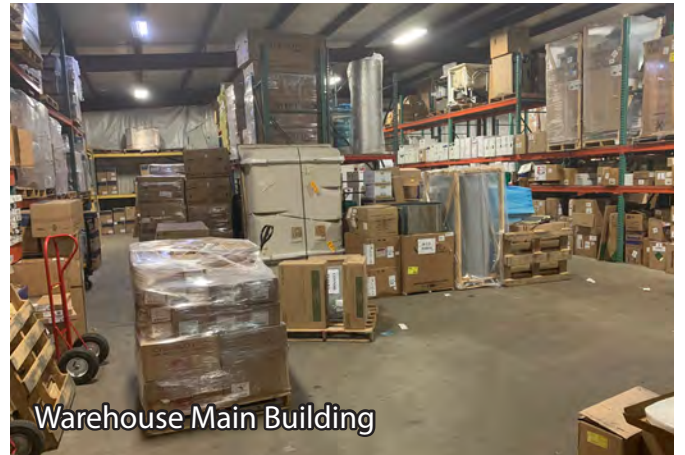
Warehouse Main Building