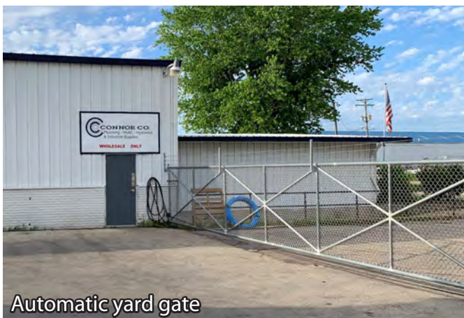
Automatic yard gate