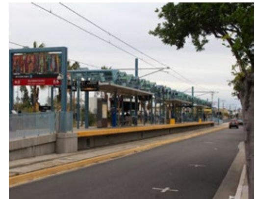
17TH STREET EXPO LINE STATION