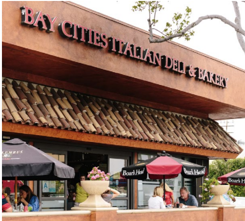
BAY CITIES DELI / 1517 LINCOLN BLVD