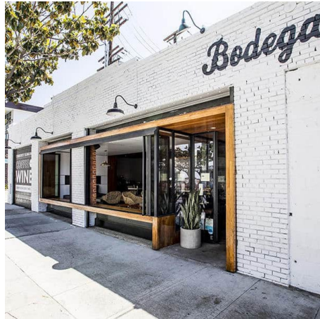
BODEGA WINE BAR / 814 BROADWAY