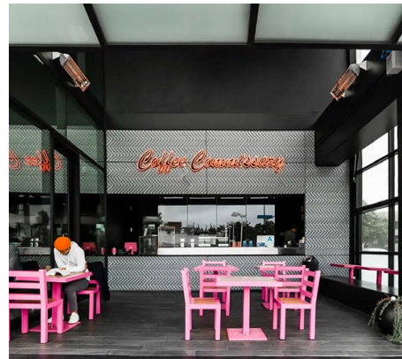
COFFEE COMMISSARY / 1402 SANTA MONICA